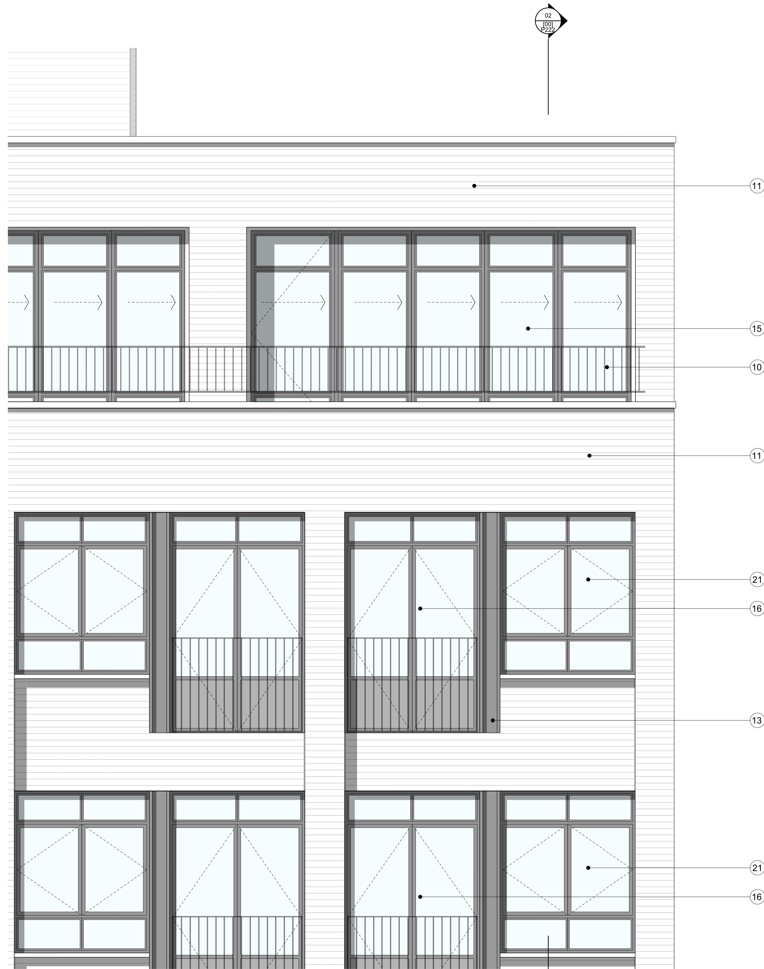
01 BAY ELEVATION: EAST ELEVATION UPPER