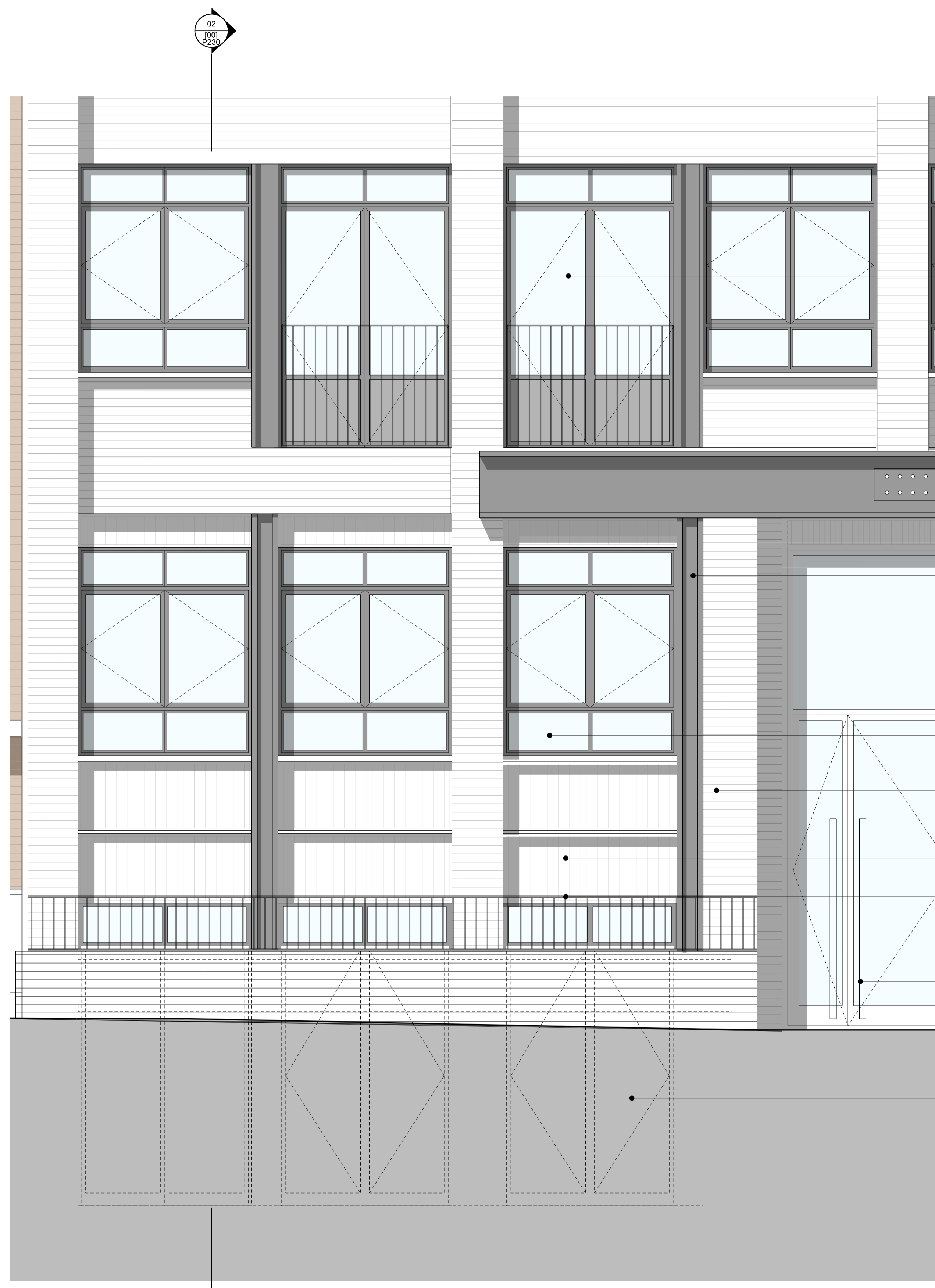
01 BAY ELEVATION: EAST ELEVATION LOWER