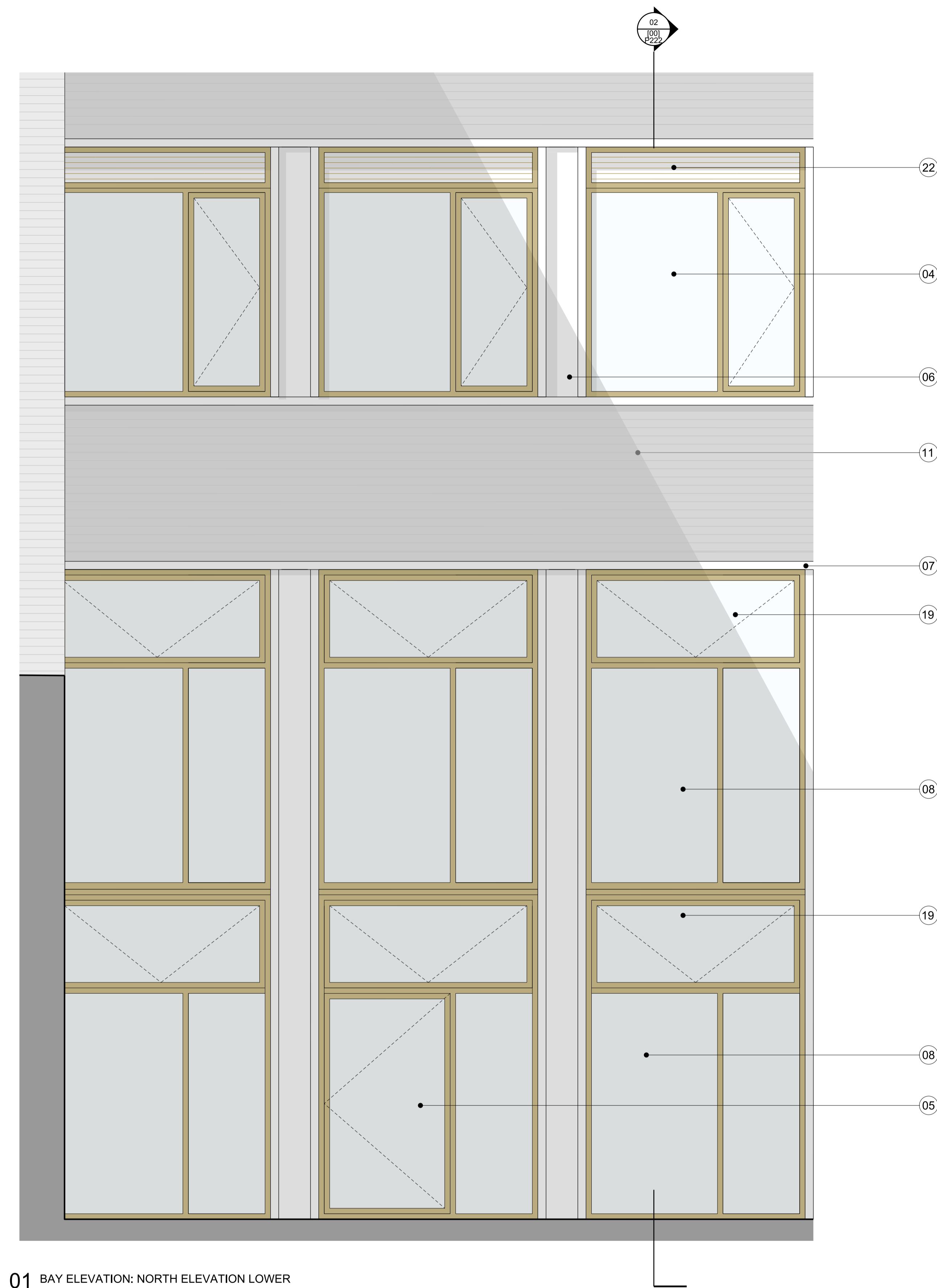
01 BAY ELEVATION: NORTH ELEVATION LOWER