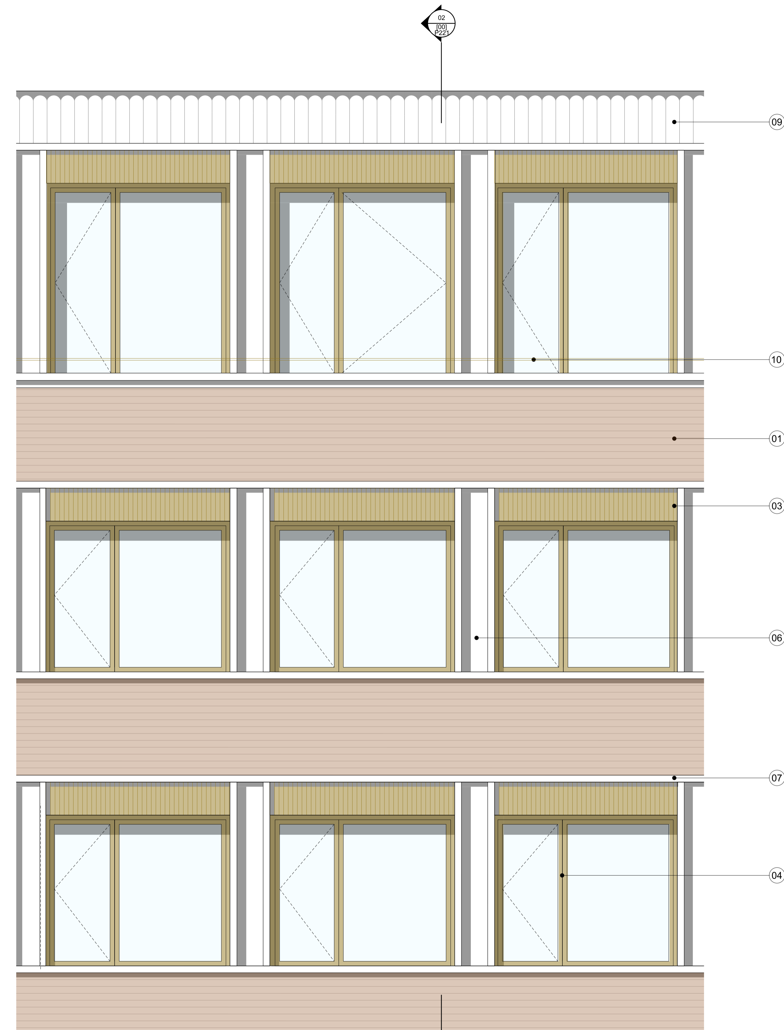
01 BAY ELEVATION: SOUTH ELEVATION UPPER