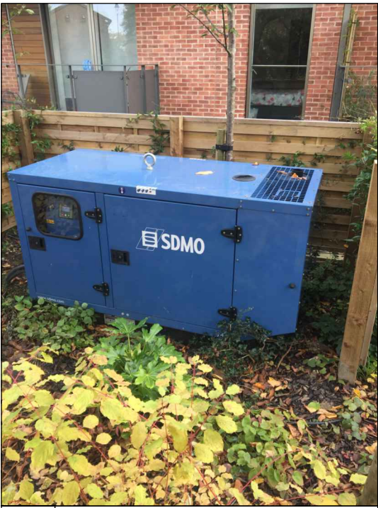
3 EXISTING LOCATION IMAGE