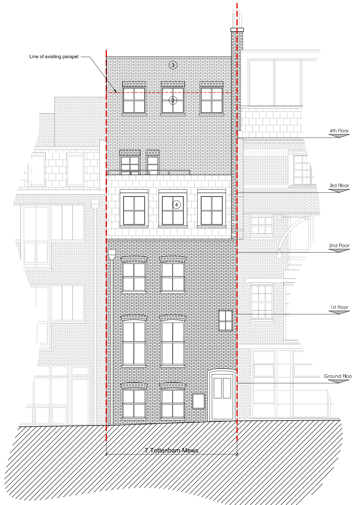
2 Rear elevation