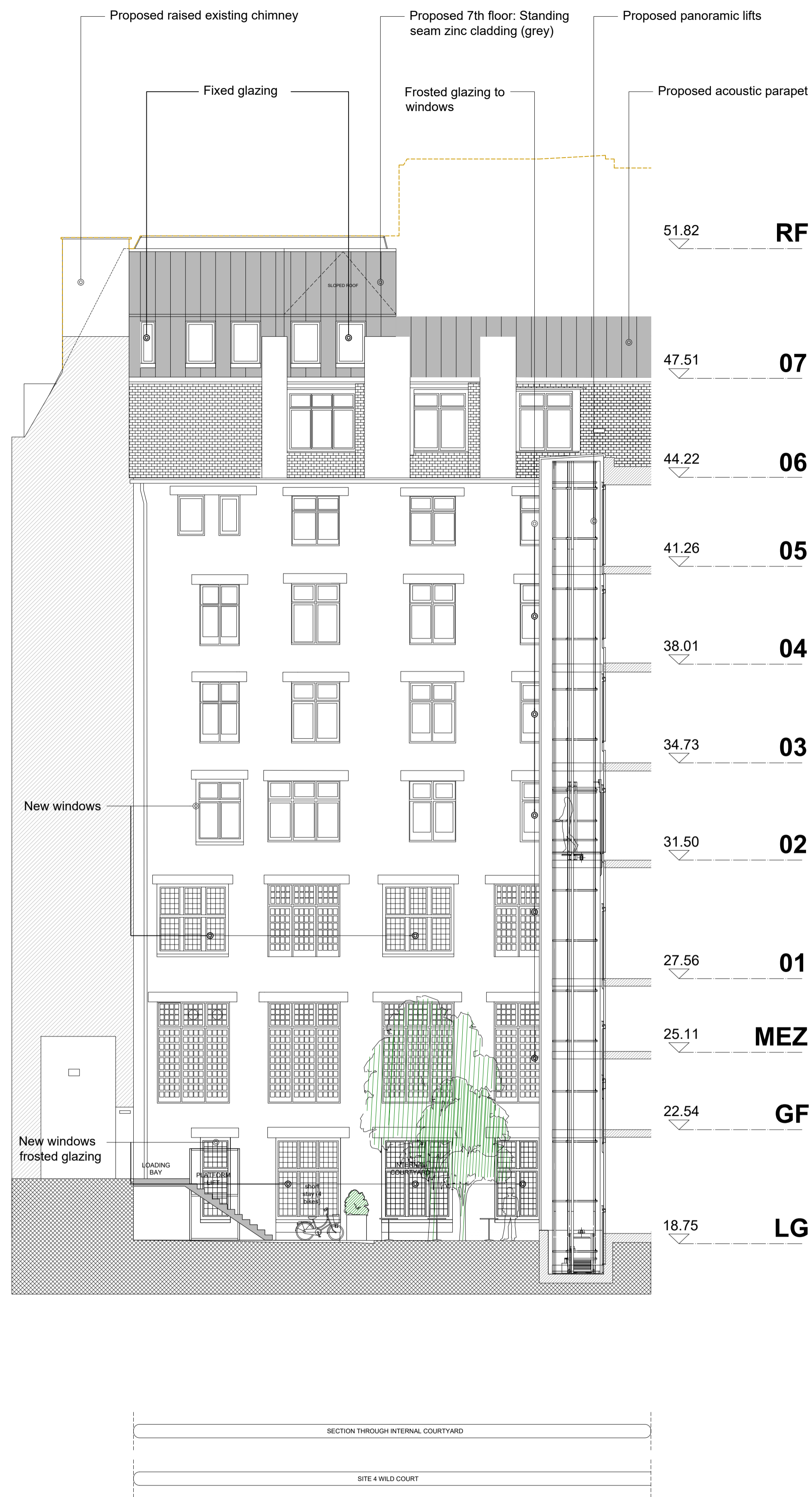
01 Proposed Elevation 03 ( Kingsway Elevation) Scale 1/100