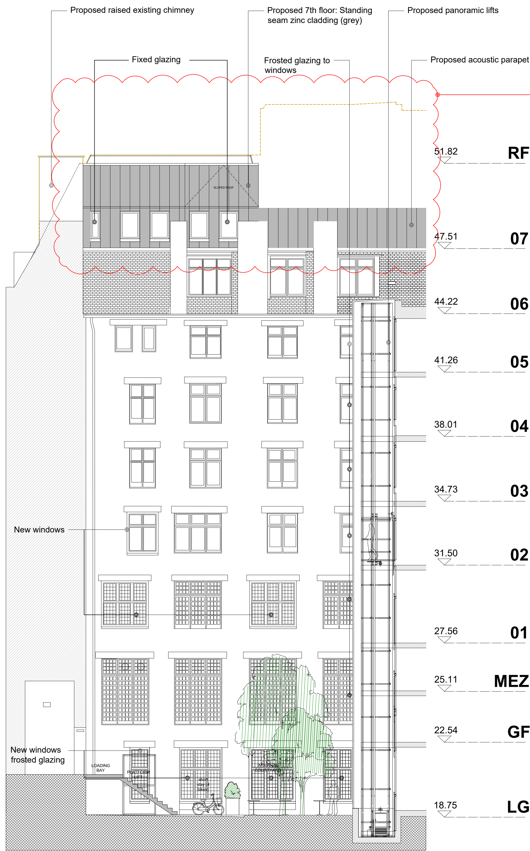
01 Proposed Elevation 03 ( Kingsway Elevation) Scale 1/100