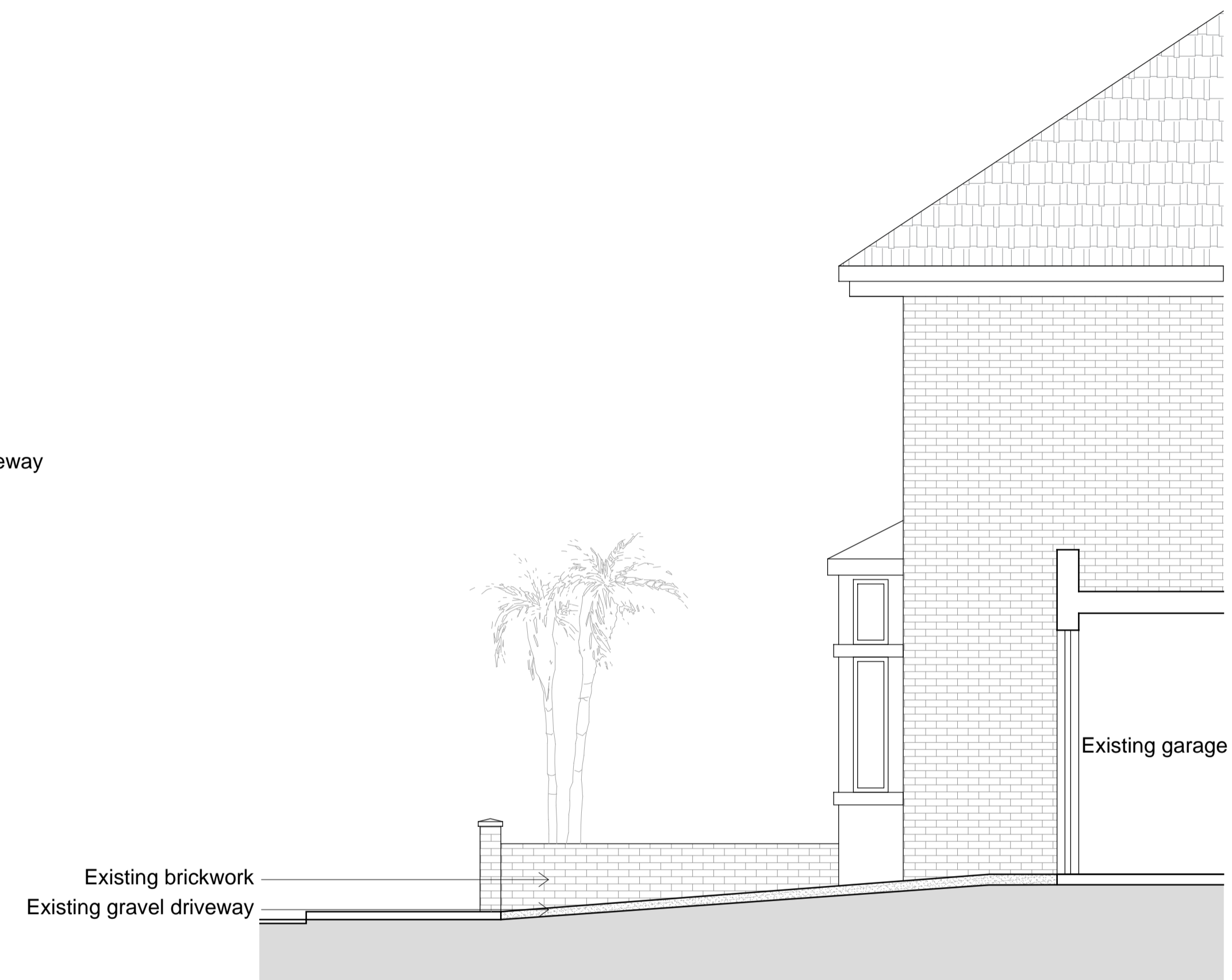
Existing Driveway Section scale 1:50