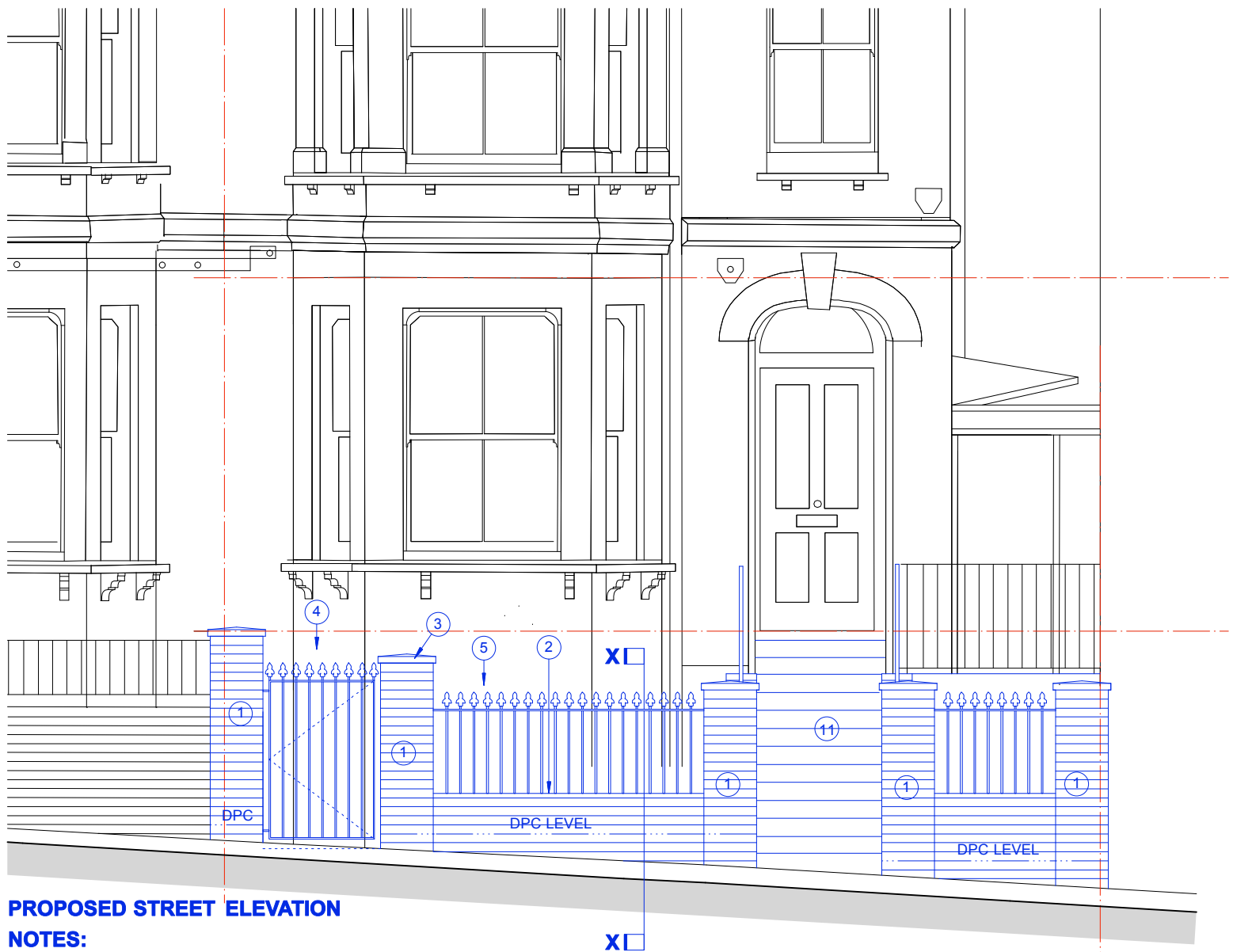
PROPOSED STREET ELEVATION