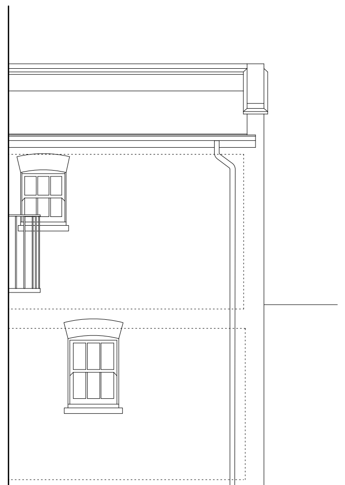
BACK EXTENSION SIDE ELEVATION