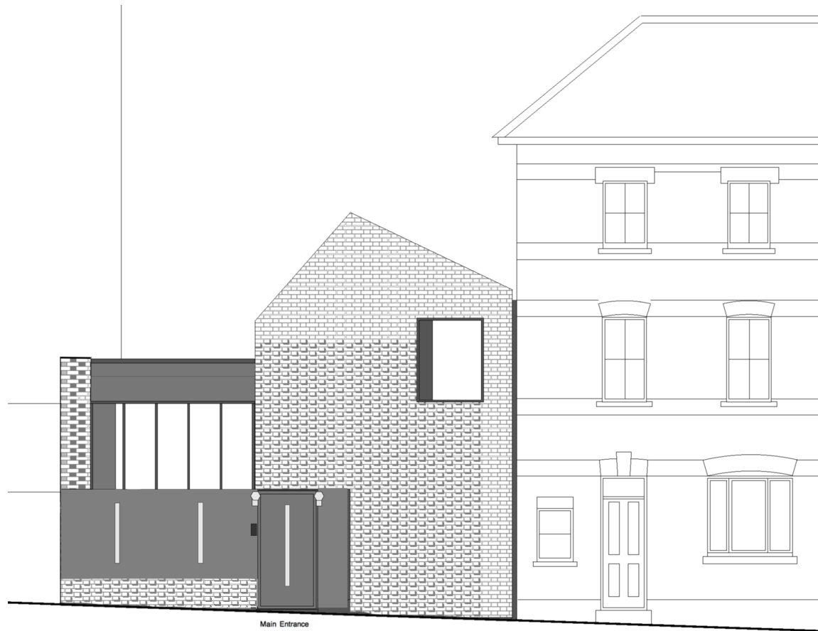
NEW COPPER HAMMERED STEEL PLATE DENCE AND ENTRANCE.