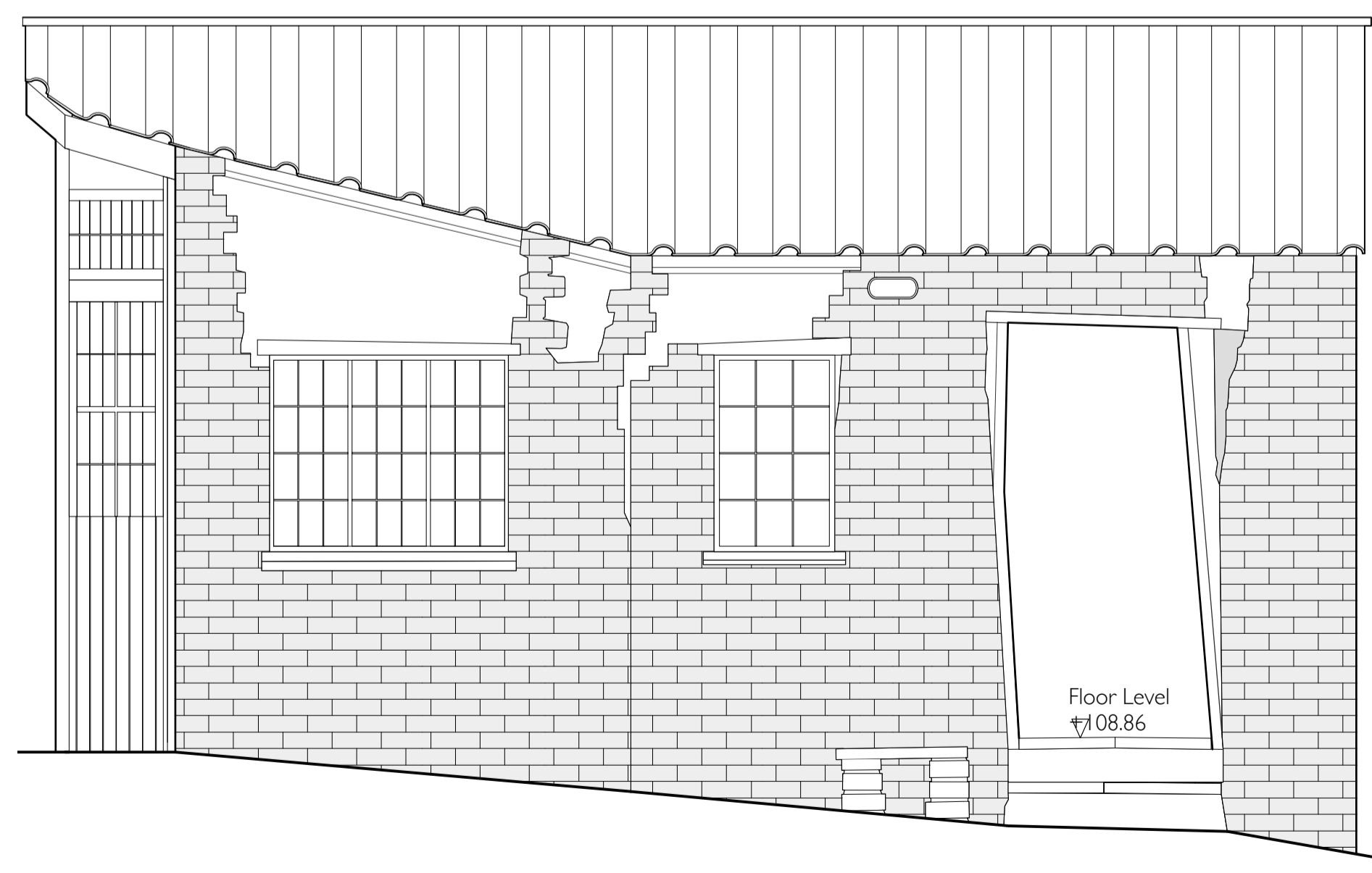
B Existing Outbuilding Elevation B 1:50 (A3)