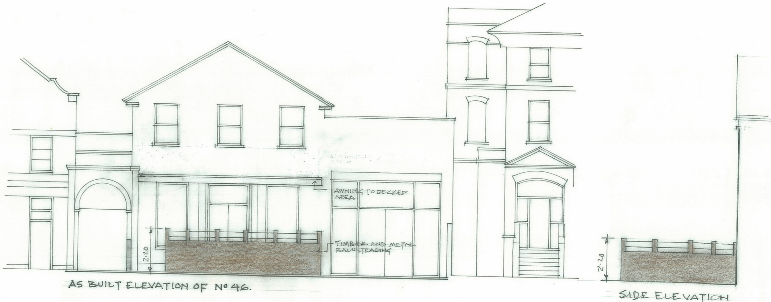
AS BUILT ELEVATION OF NO 46.