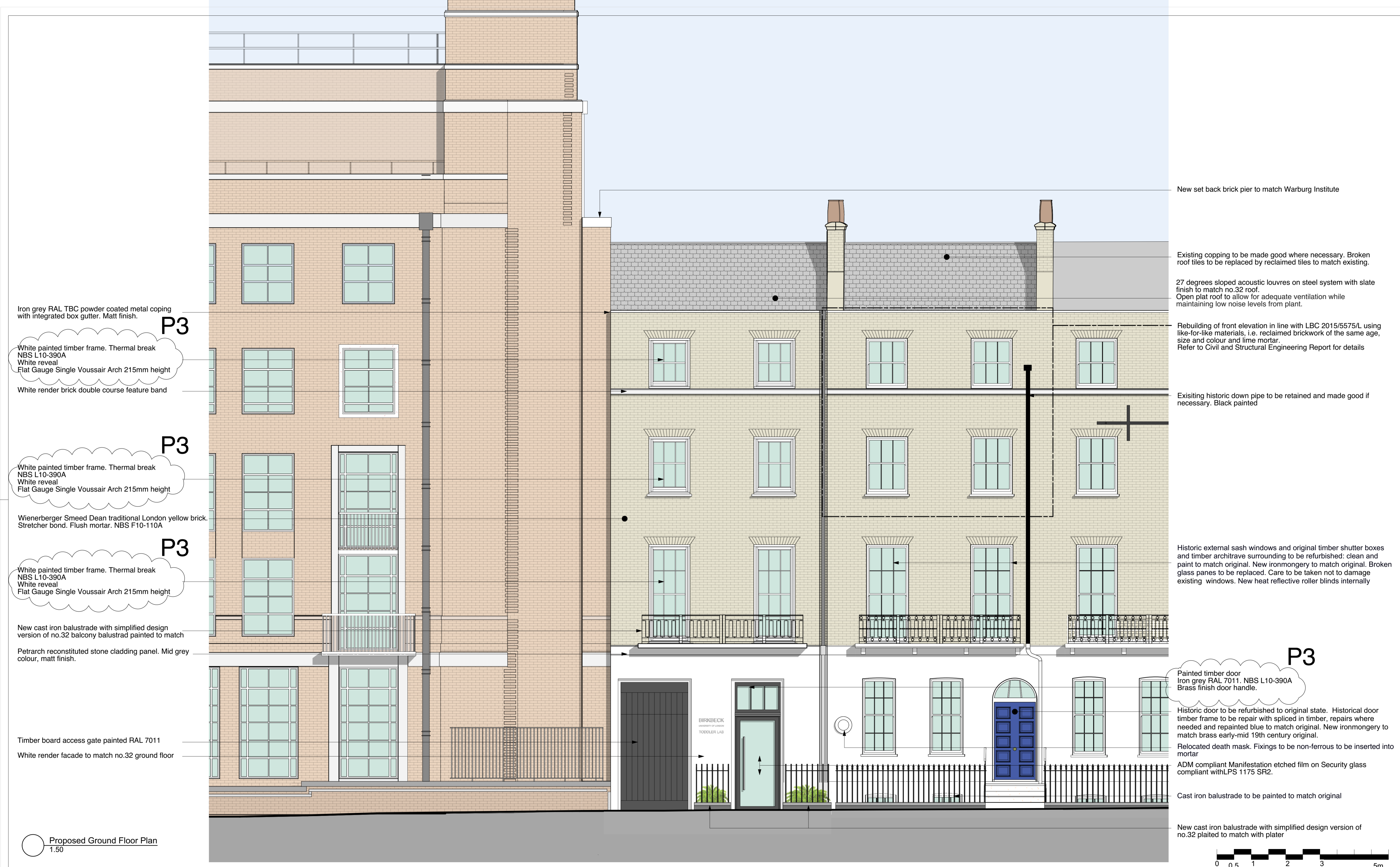
Proposed Ground Floor Plan 1.50