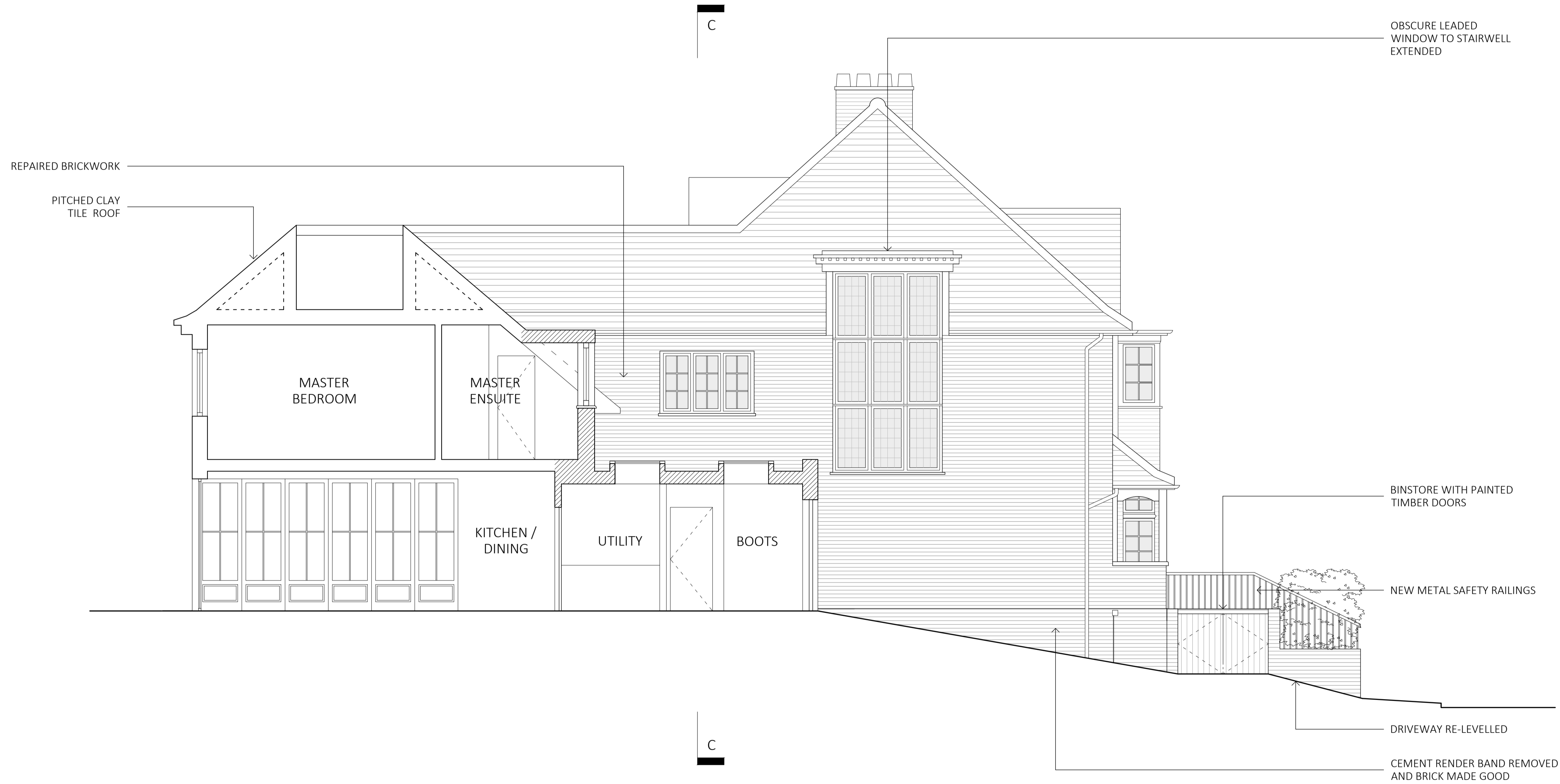
SECTION D - D