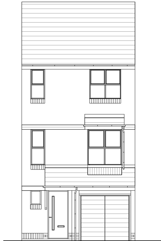
Existing Front Elevation Scale: 1:100

This drawing is the property of Orb Property Planning Ltd and may not be reproduced, loaned or copied, in part or in full, without the prior written consent of Orb Property Planning Ltd. This drawing is not for construction purposes, unless otherwise stated. The Contractor is responsible for checking all dimensions before any work starts or any materials are ordered. Any discrepancies must be brought to the attention of Orb Property Planning Ltd immediately.