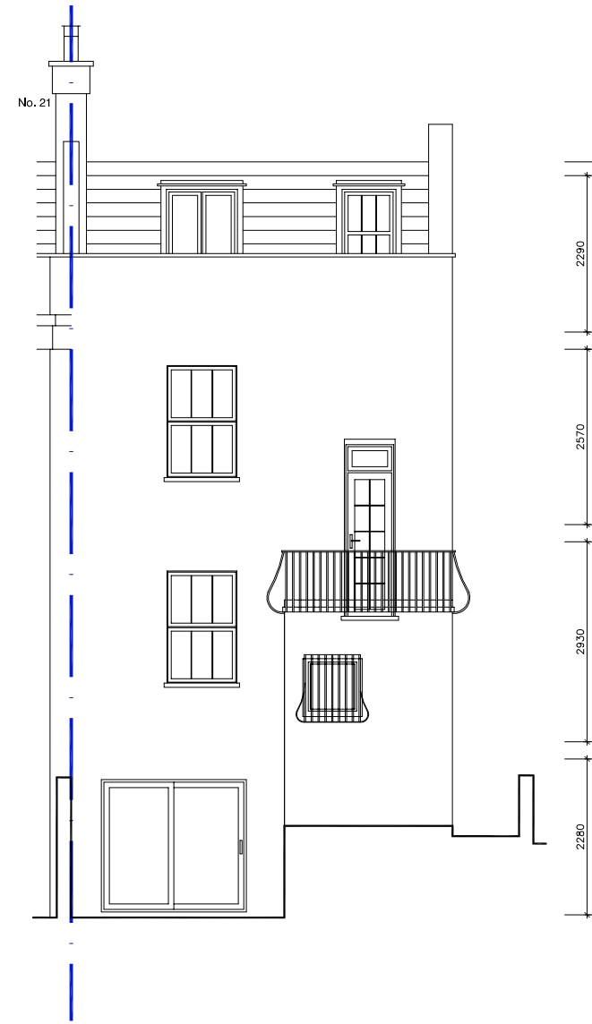
rear elevation as existing