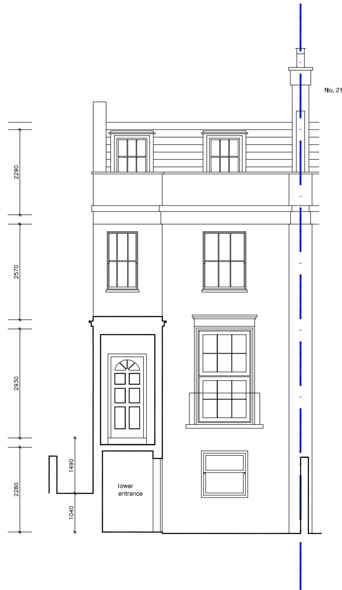
front elevation- through well as existing