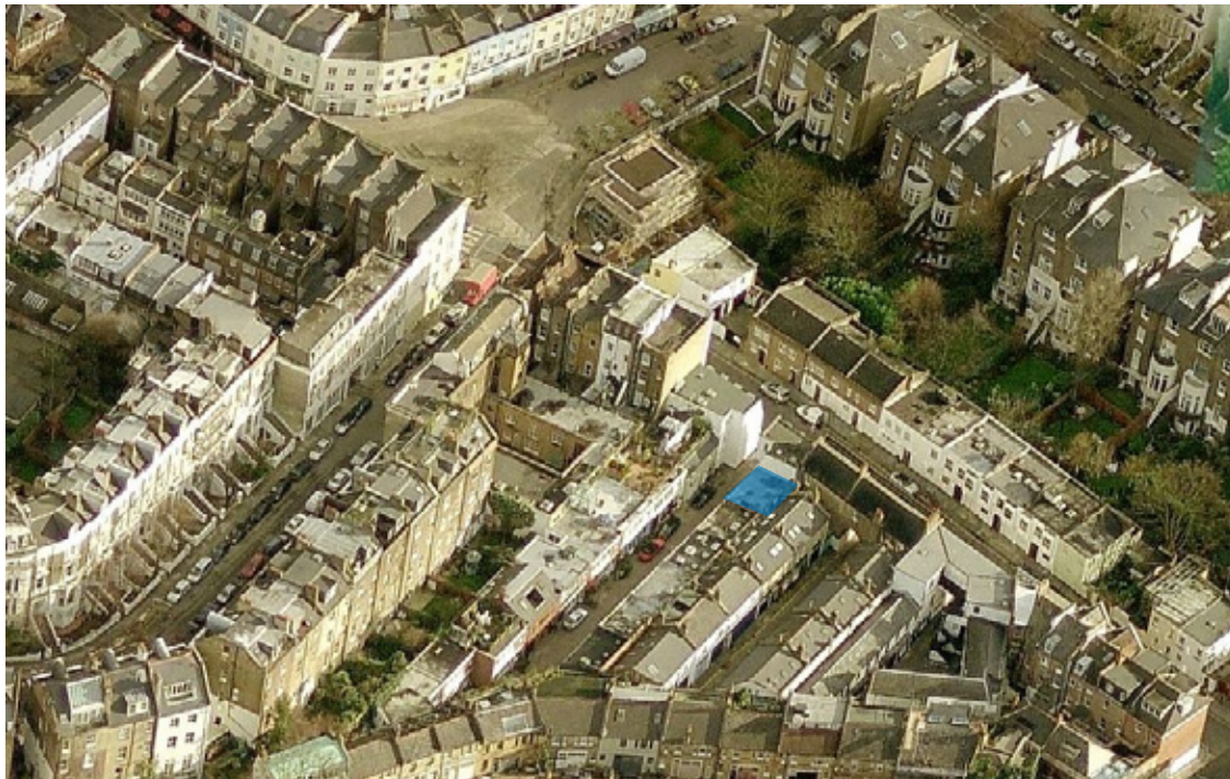
Aerial view looking East showing 17 Belsize Park Mews in blue