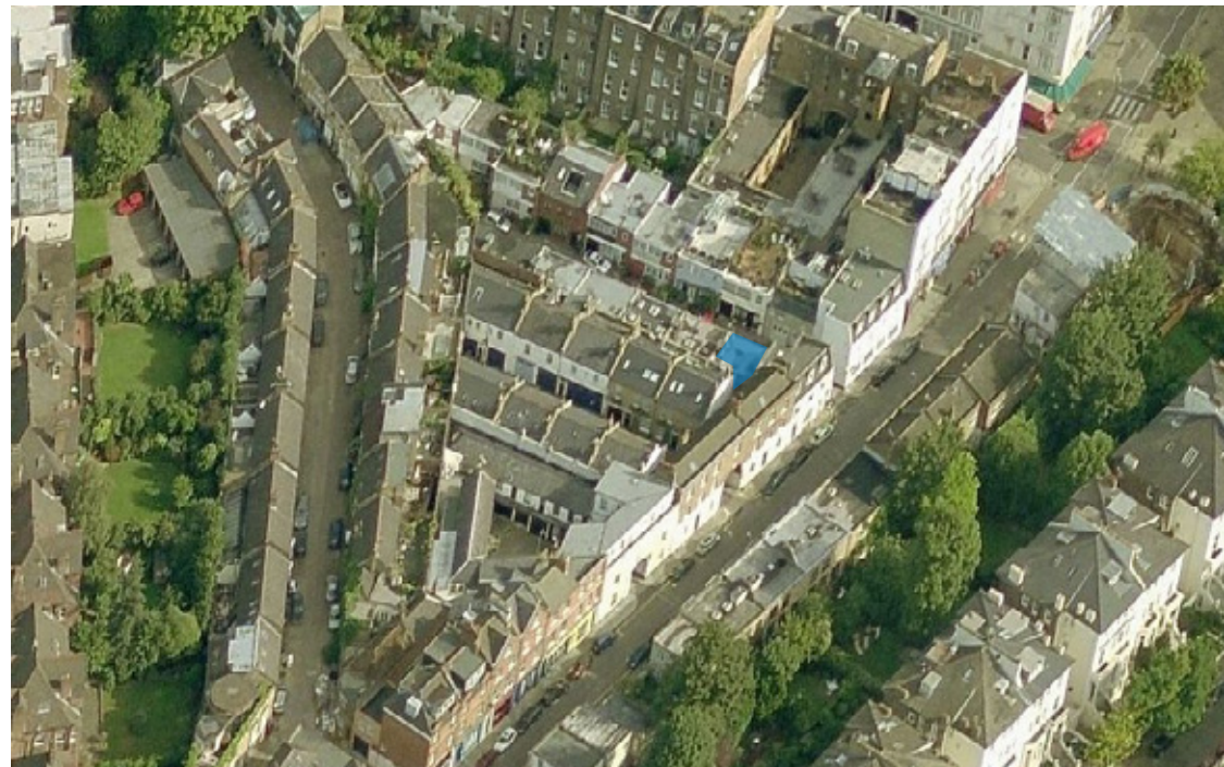
Aerial view looking North showing 17 Belsize Park Mews in blue