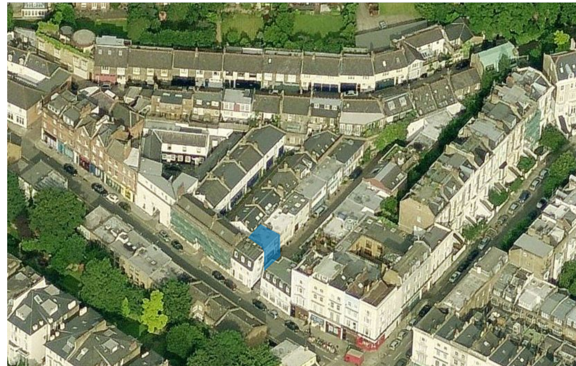
Aerial view looking West showing 17 Belsize Park Mews in blue