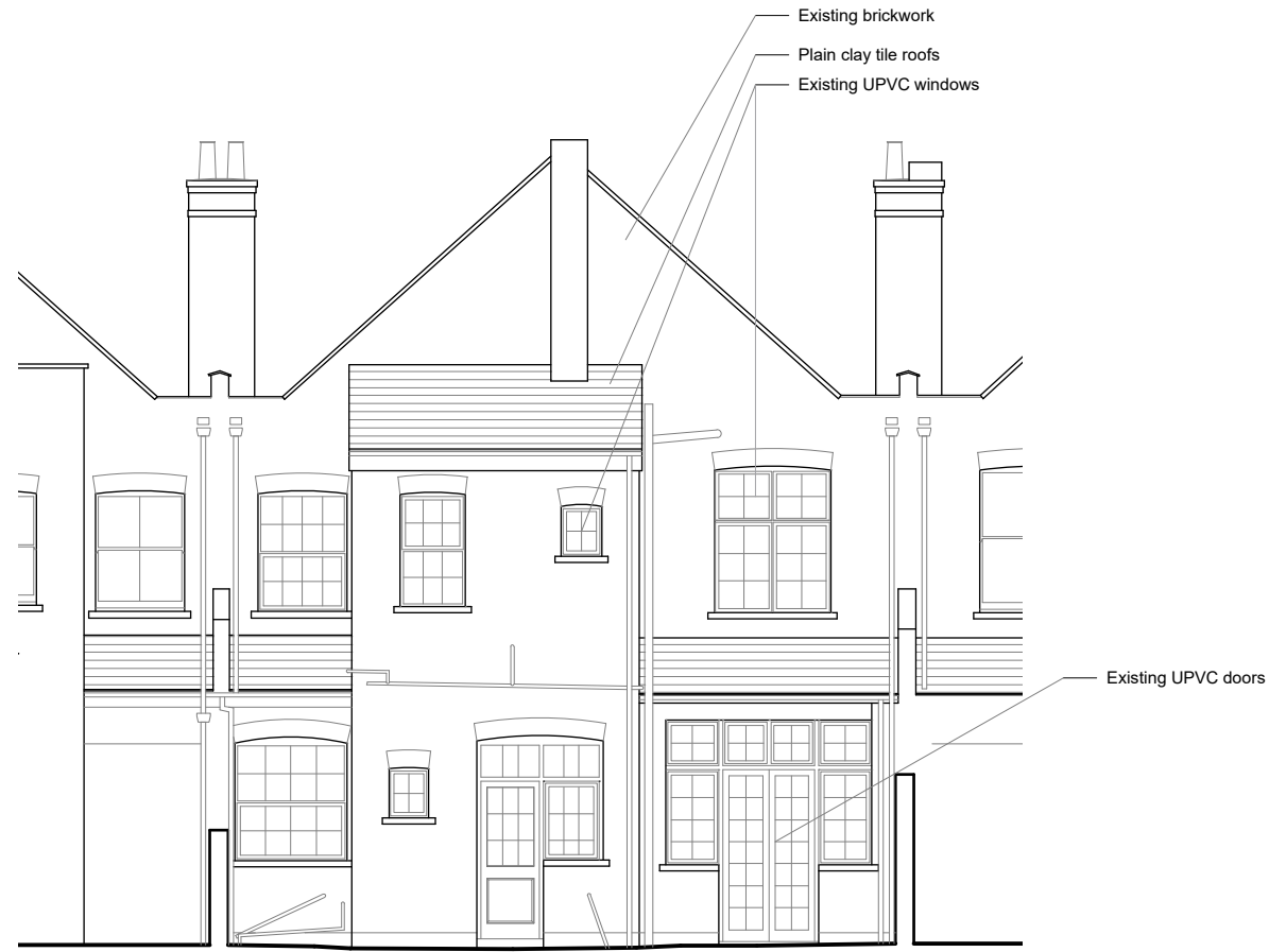
1 Rear elevation - Existing 1:100