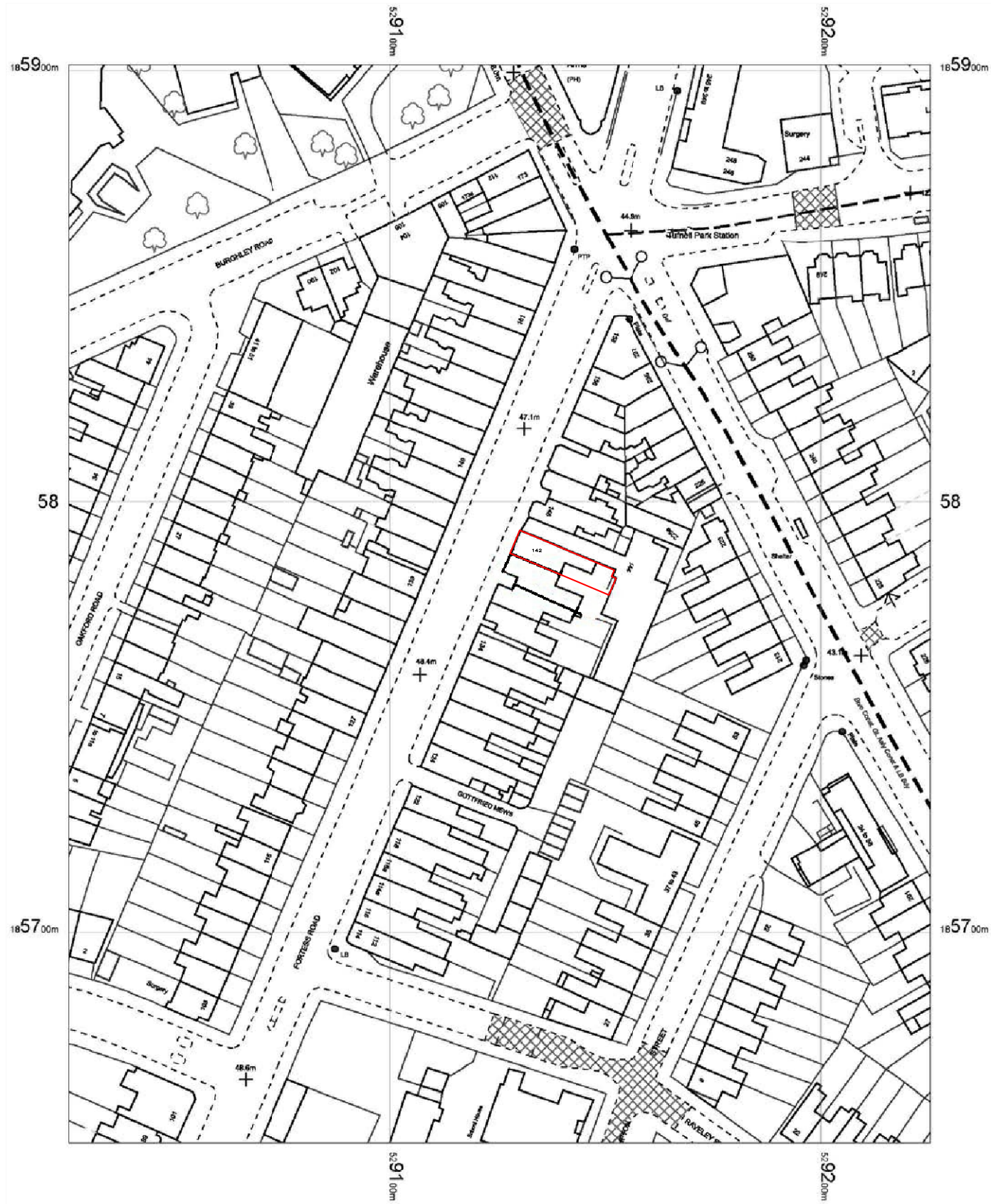
Location plan - scaled at 1:1250 at A3