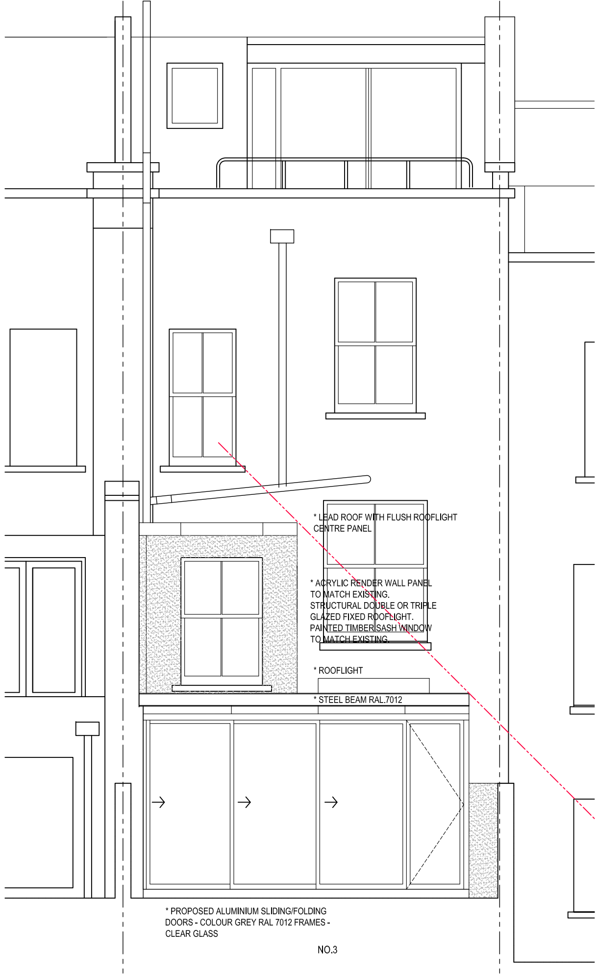
2 ELEVATION AS PROPOSED SCALE 1:50@A3