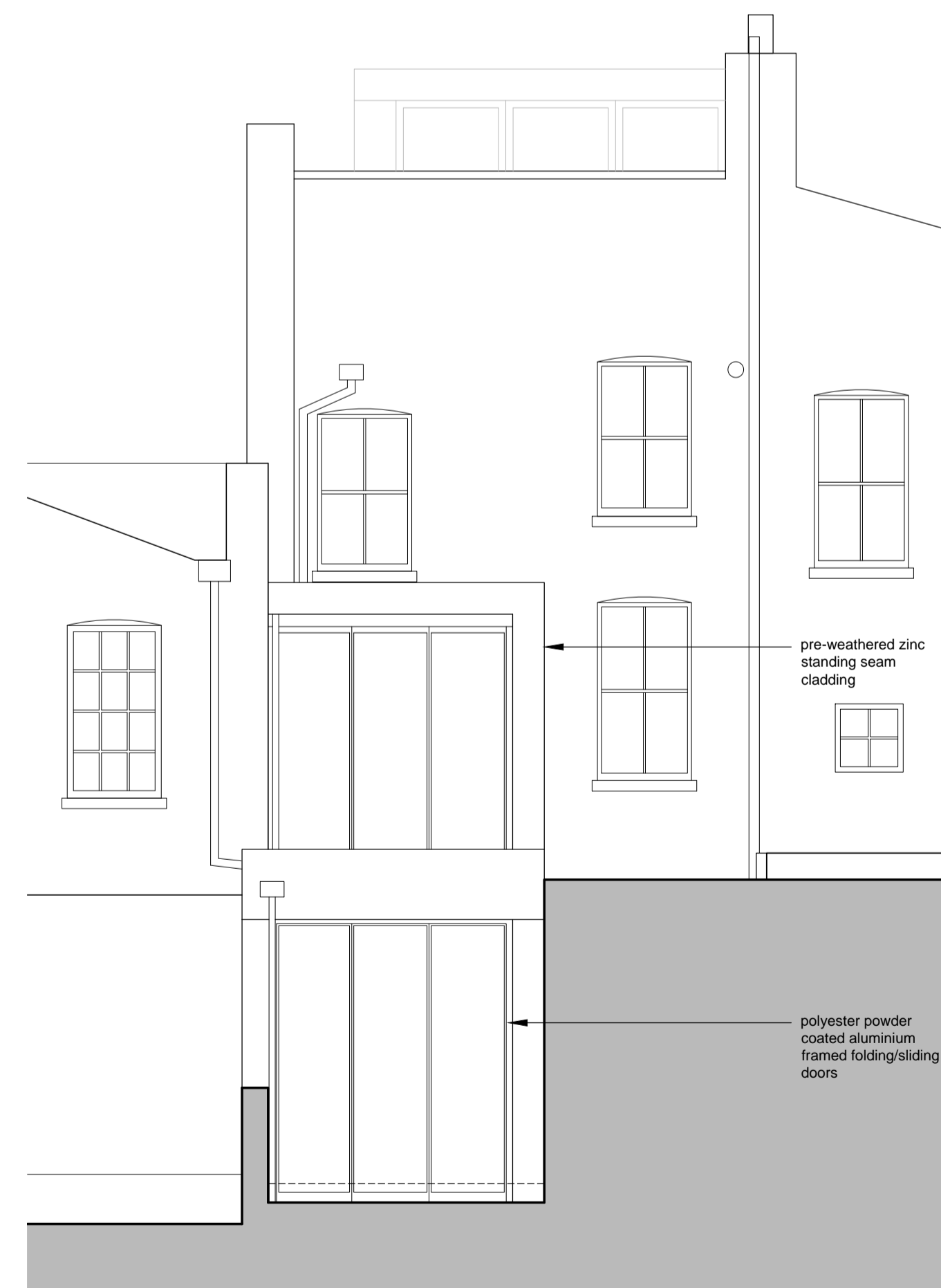
PROPOSED SECTION FF / REAR ELEV. - OPTION 2