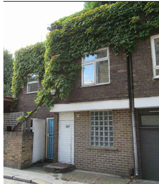
107 CAMDEN MEWS