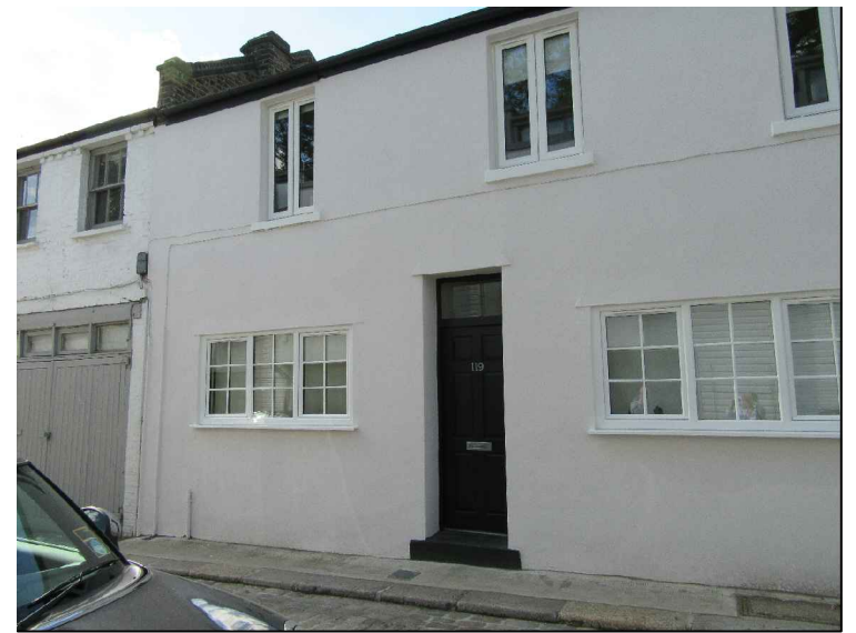
EXISTING UPVC WINDOWS