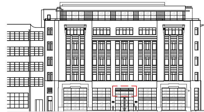
04 Cleveland Street Elevation Showing Location of Canopy Scale 1:500 @ A3