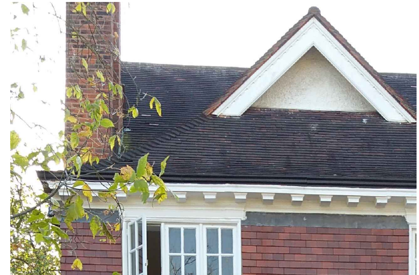
Timber detail Detail