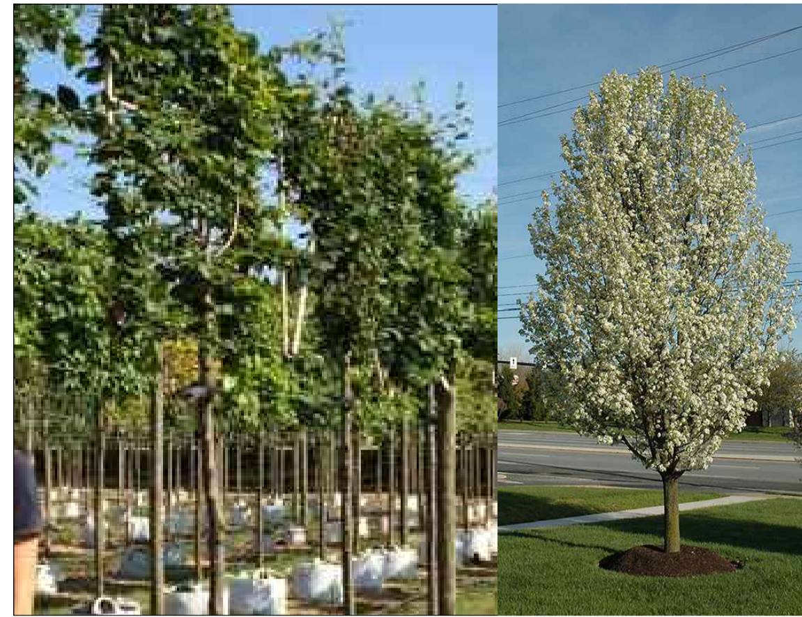
Pleached Carpinus and Pyrus Chanticleer