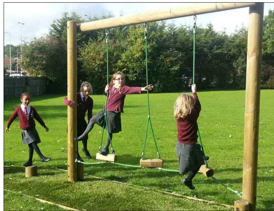
Wooden Trim Trail Play Equipment