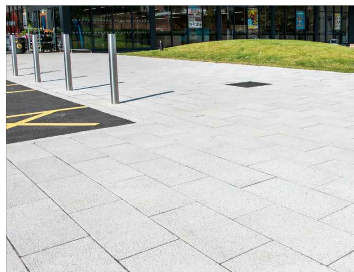
Fusion Modular Granite Paving (Large Unit)