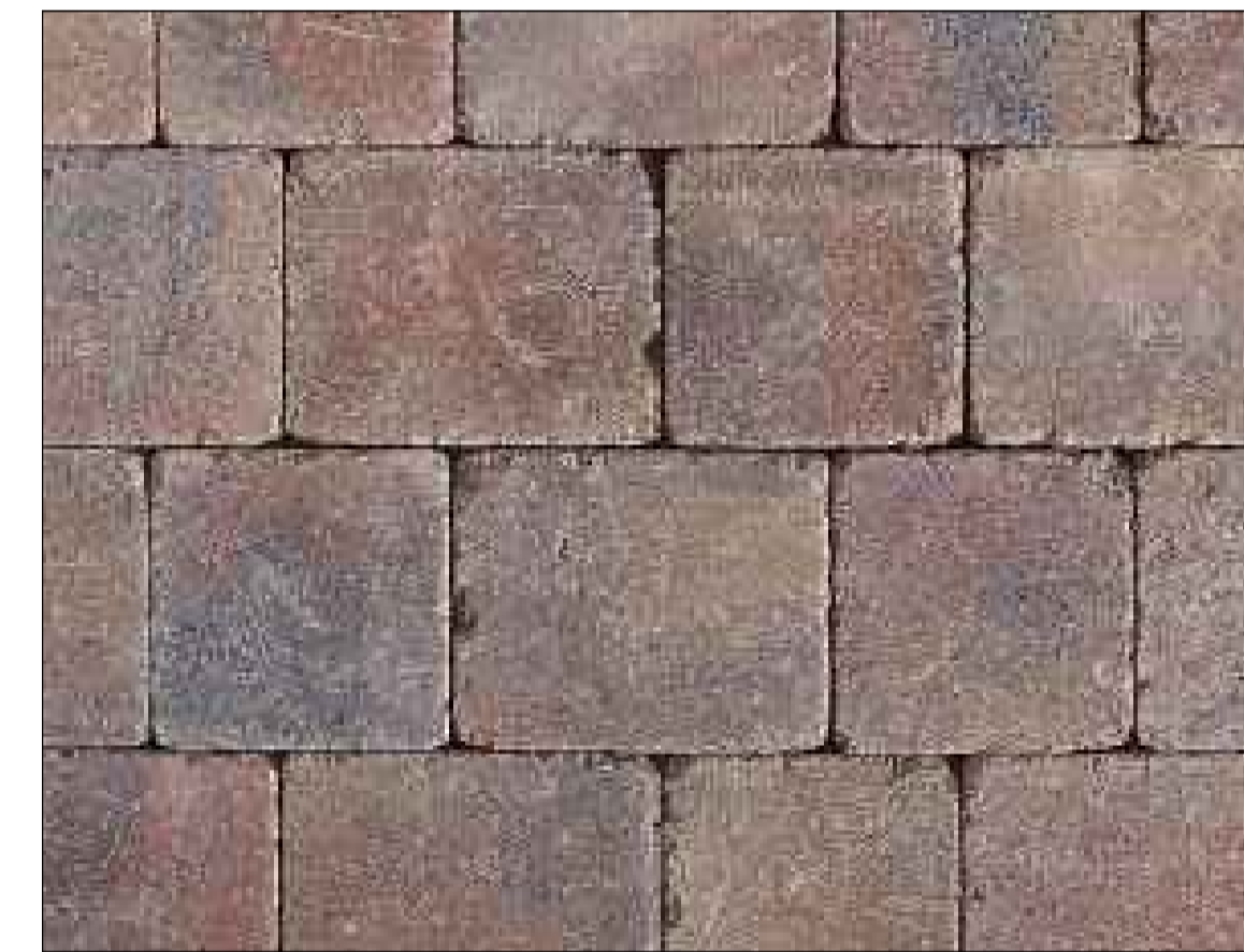
Tegula 'Trio' (Allotment Area)