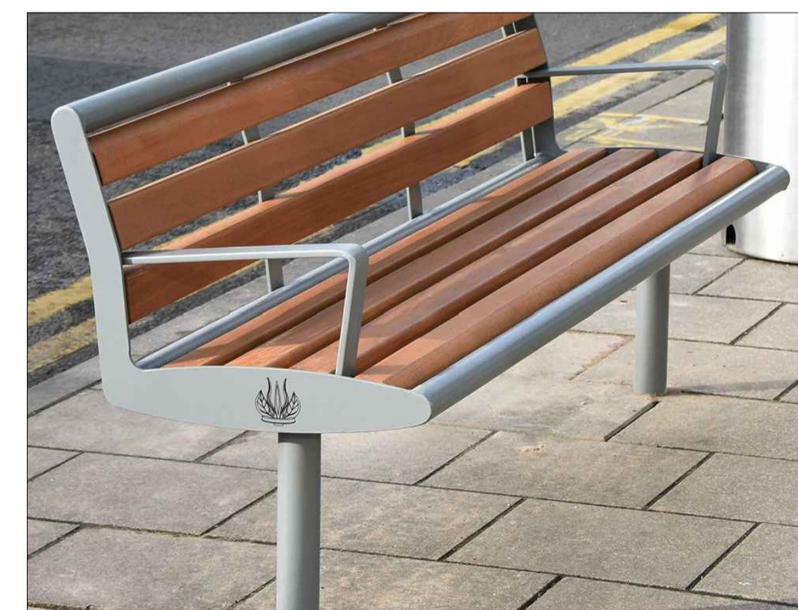
Steel Frame Seats with Timber Slats

Notes All dimensions in mm, unless otherwise stated. All information outside red line boundary shown for contextual purpose only