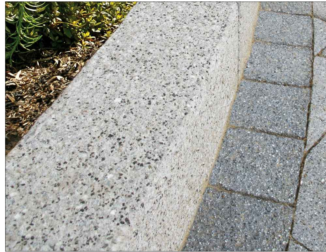
Wide Country Kerbs