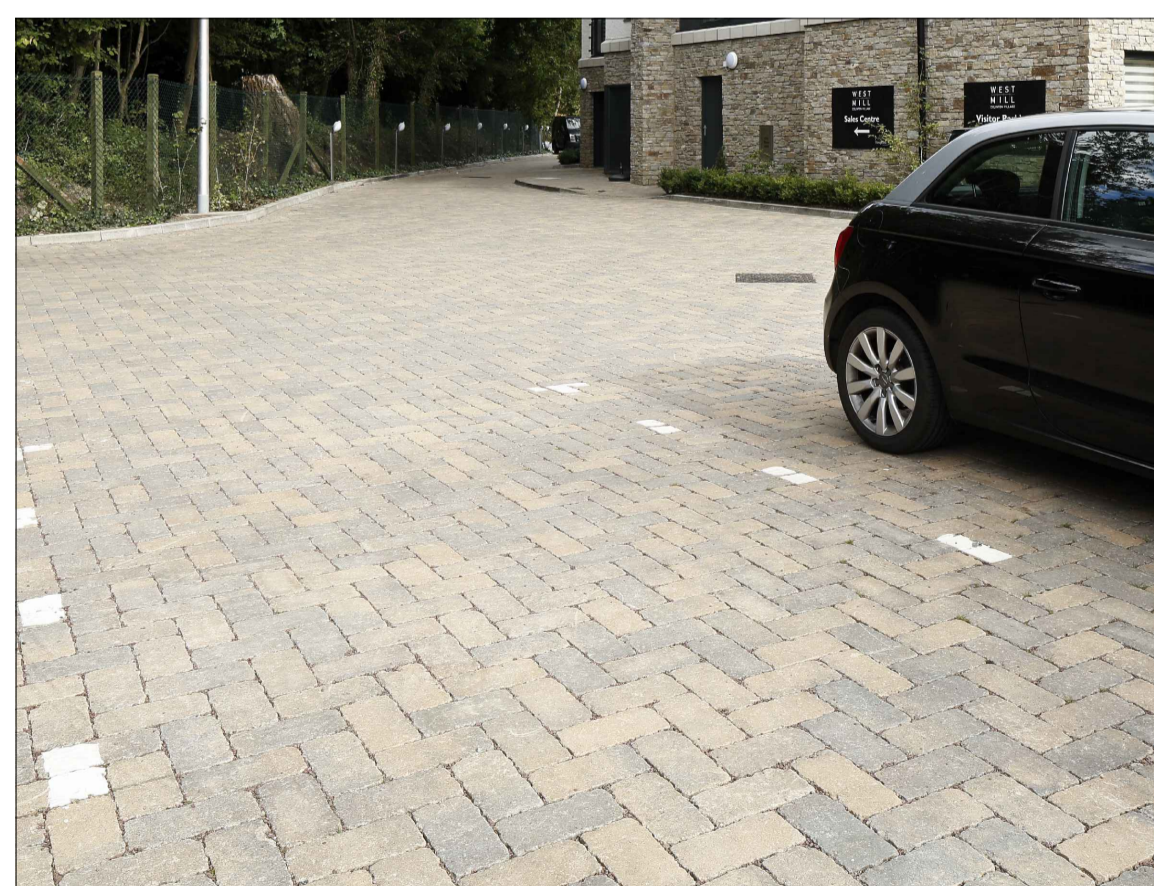
Hydropave Permeable Car Parking Areas