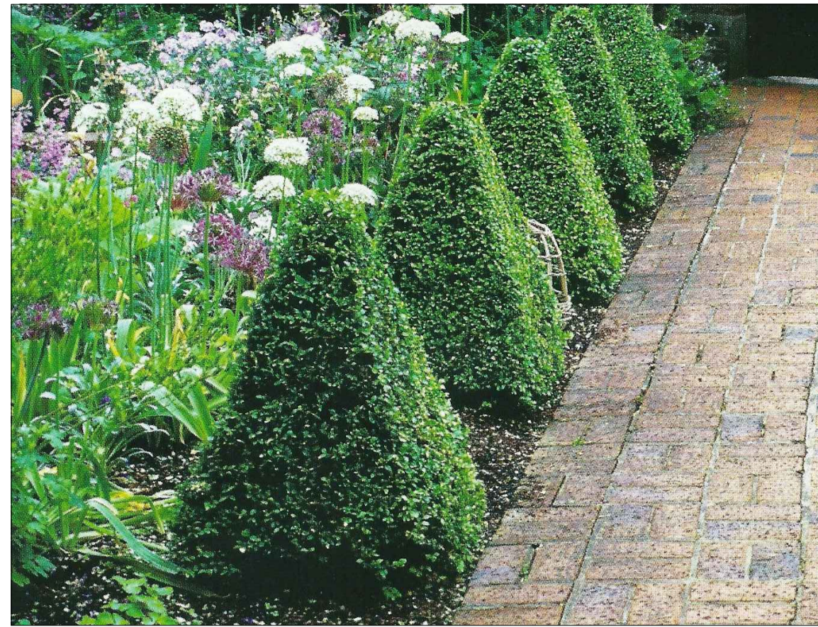
Buxus Pyramids with Ornamental Planting