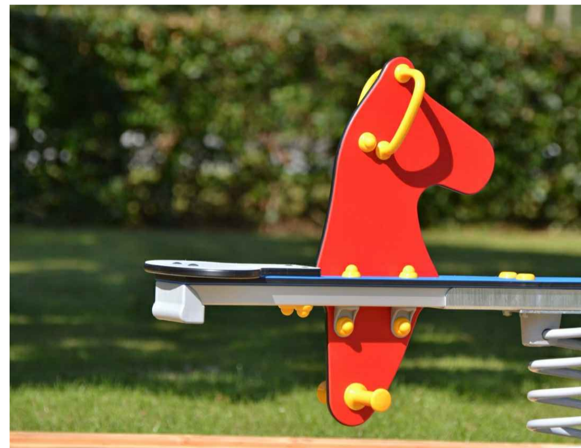
See-saw Rocker Play Equipment