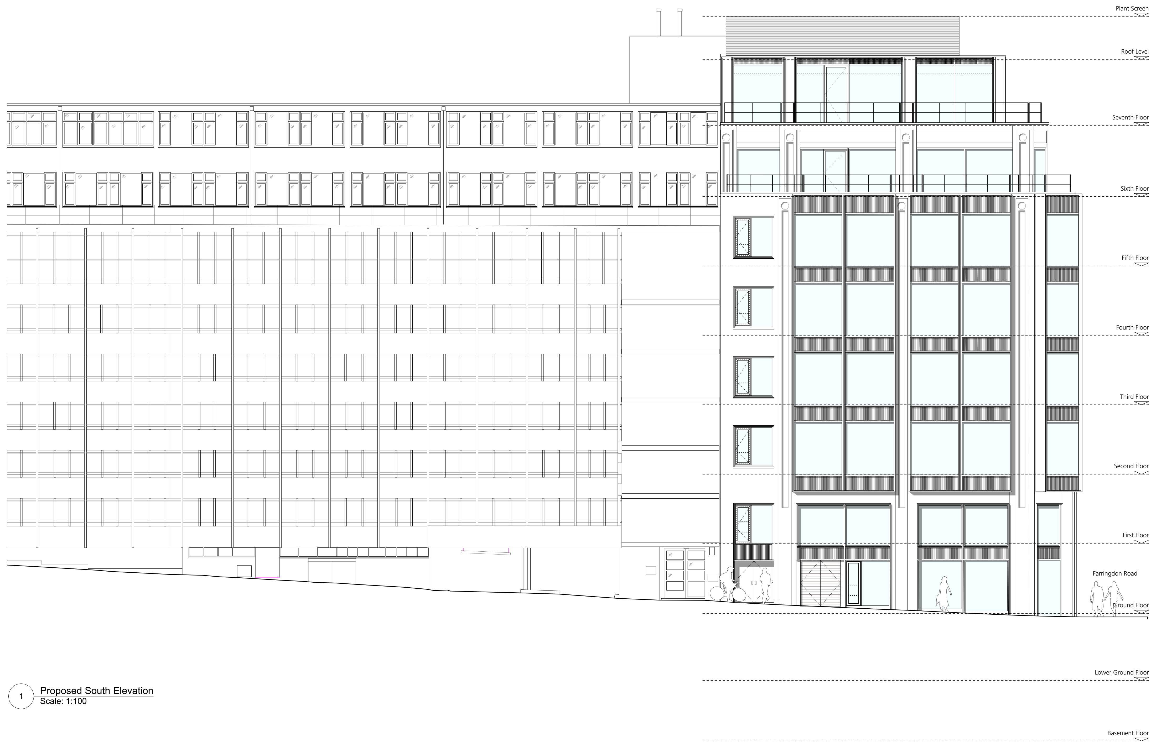
1 Proposed South Elevation Scale: 1:100