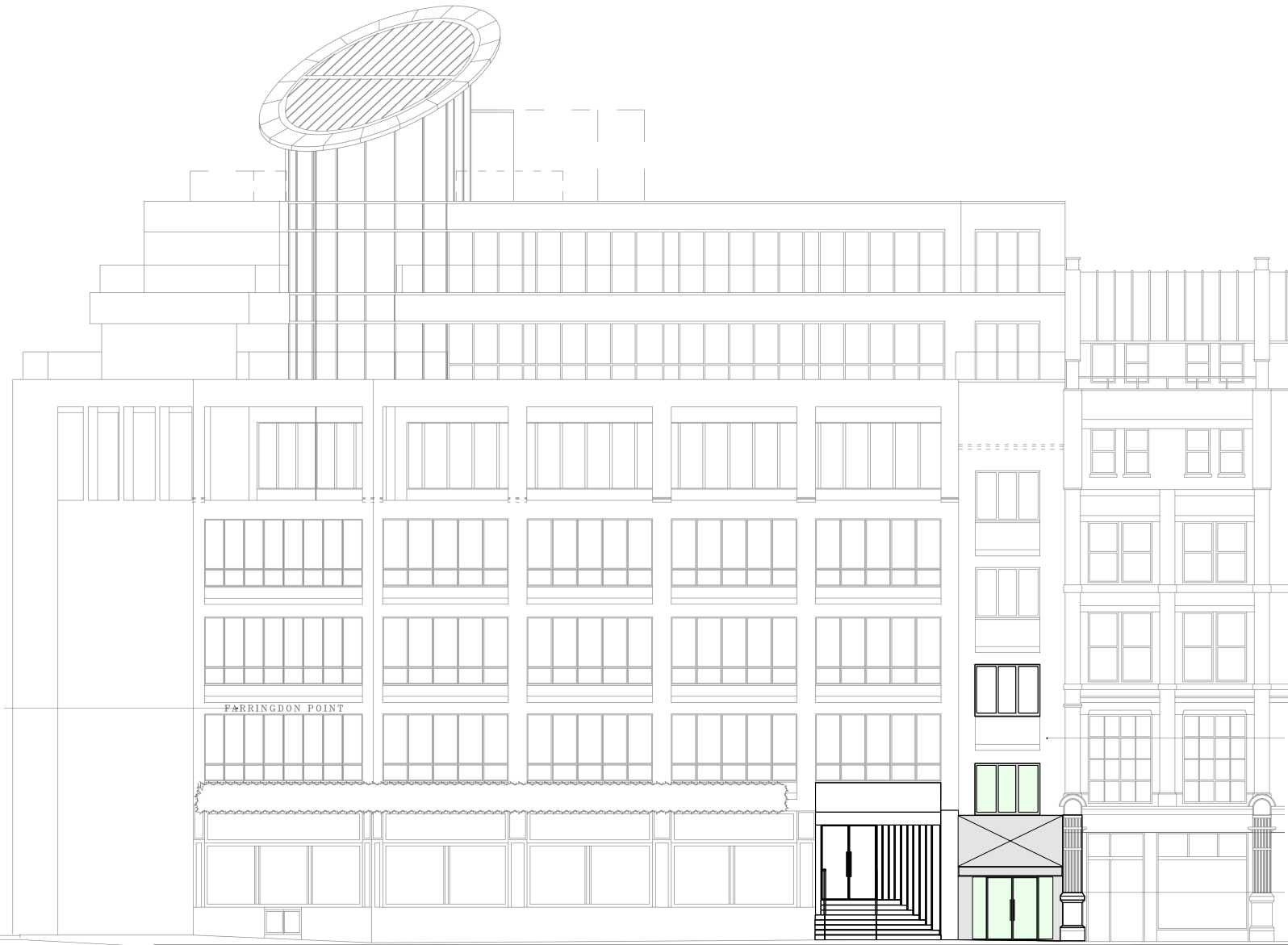
3 PROPOSED FRONT ELEVATION 1:100 @ A1/1:200 @ A3