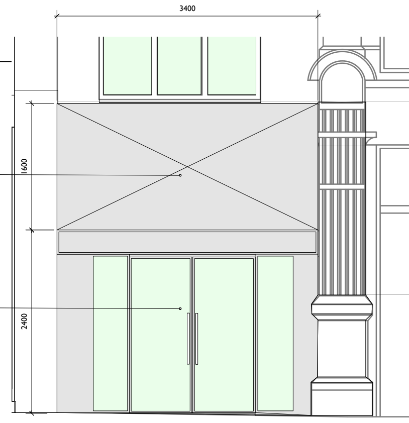
2 PROPOSED FRONT ELEVATION 1:25 @ A1/1:50 @ A3