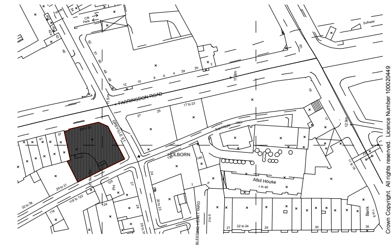
1 LOCATION PLAN 1:1250 @ A1 / 1:2500 @ A3