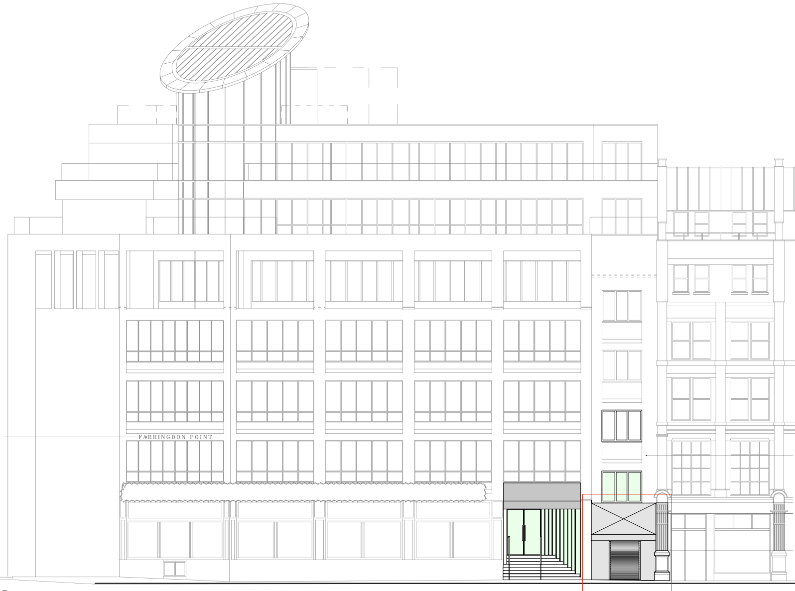
3 EXISTING FRONT ELEVATION 1:100 @ A1/1:200 @ A3