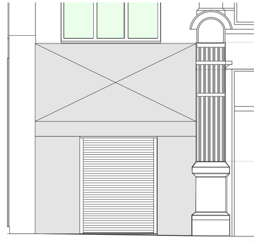
2 EXISTING FRONT ELEVATION 1:25 @ A1/1:50 @ A3

Crown Copyright. All rights reserved. Licence Number 100020449