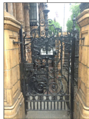
EXISTING GATE FRONT ELEVATION - EXISTING