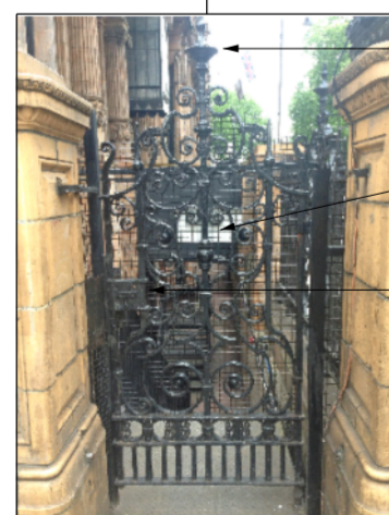
EXISTING DECORATIVE DETAILS RETAINED INC FINIALS NEW STATUTORY SIGNAGE TO FRONT OF GATE EXISTING LOCK BARREL ADAPTED AND RE-FINISHED BLACK EXISTING GATE FRONT ELEVATION - PROPOSED