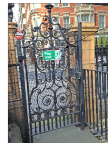
EXIT FIRE EXIT SIGNAGE RETAINED AS EXISTING NEW GATE INTO EXISTING RAILINGS (AS CONSENTED EPR DRAWING 10089-T-01-2421-ZB1) EXISTING GATE REAR ELEVATION - RETAINED AS EXISTING