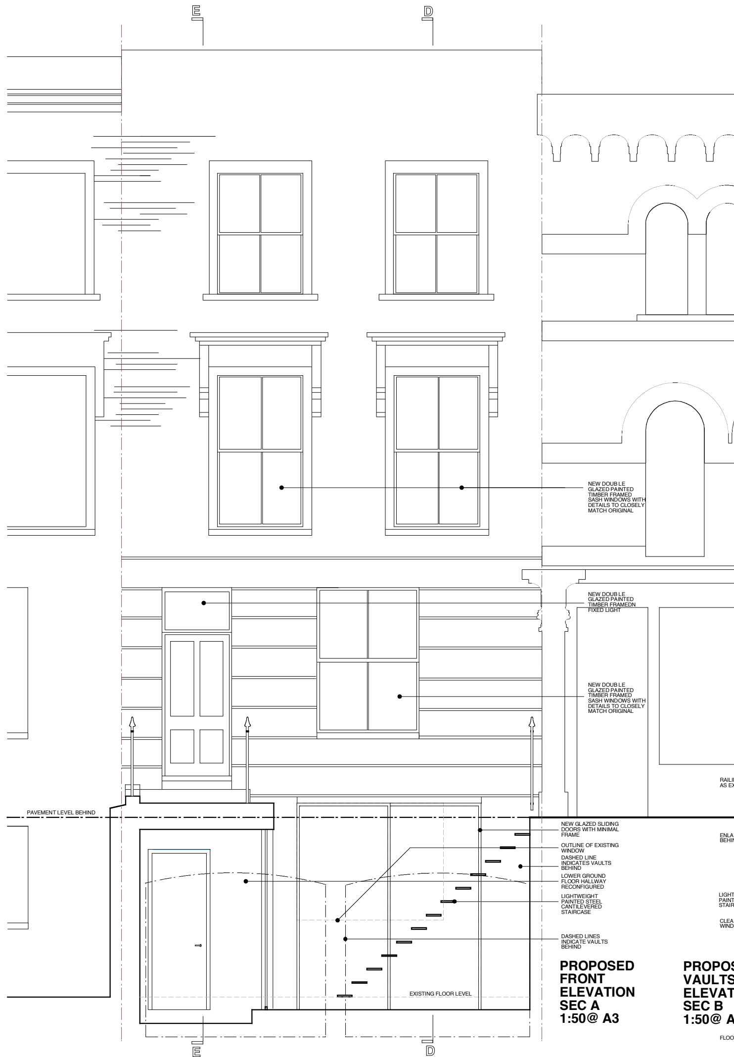
PROPOSED FRONT ELEVATION SEC A 1:50 @ A3