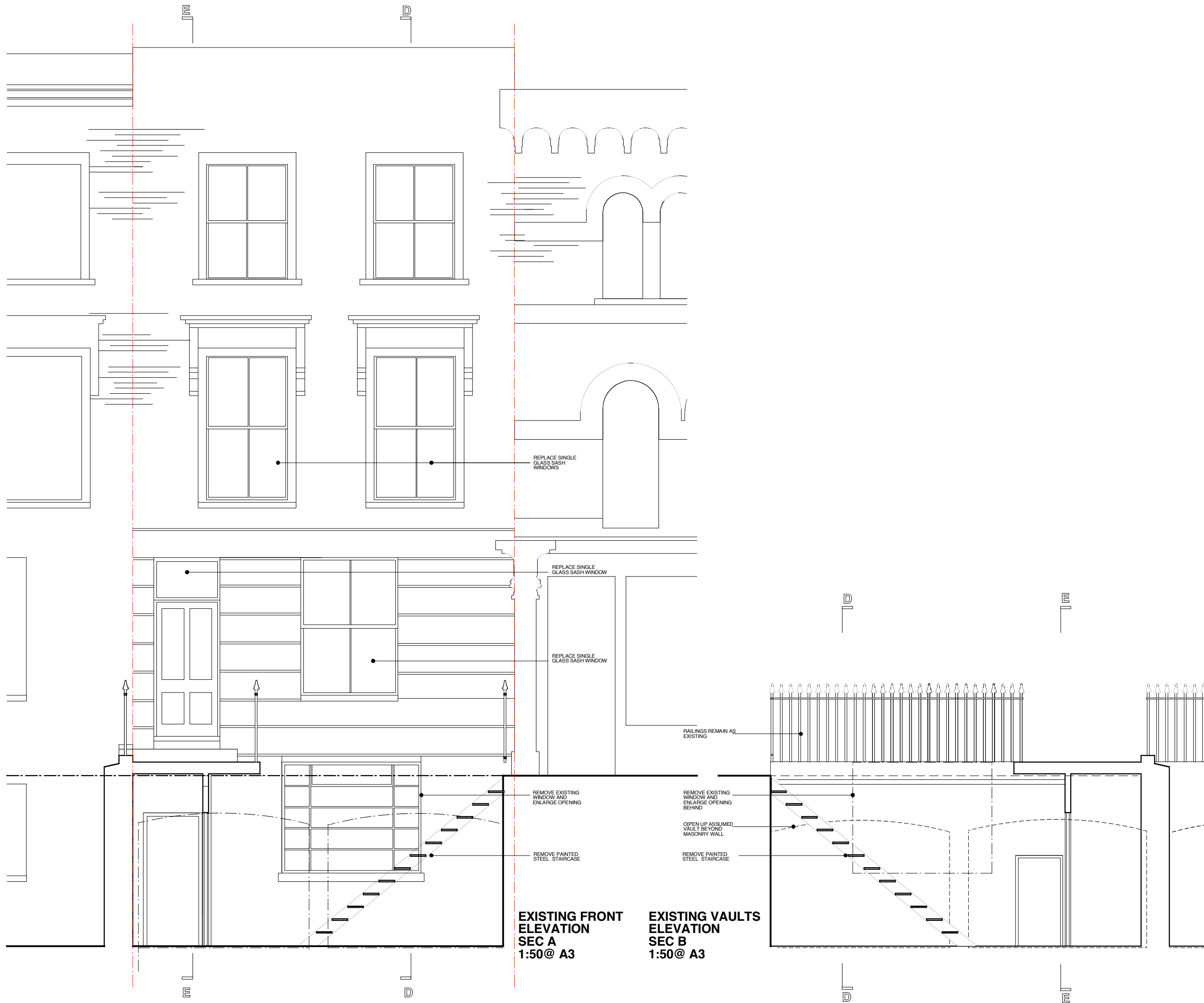
EXISTING FRONT ELEVATION SEC A 1:50 @ A3