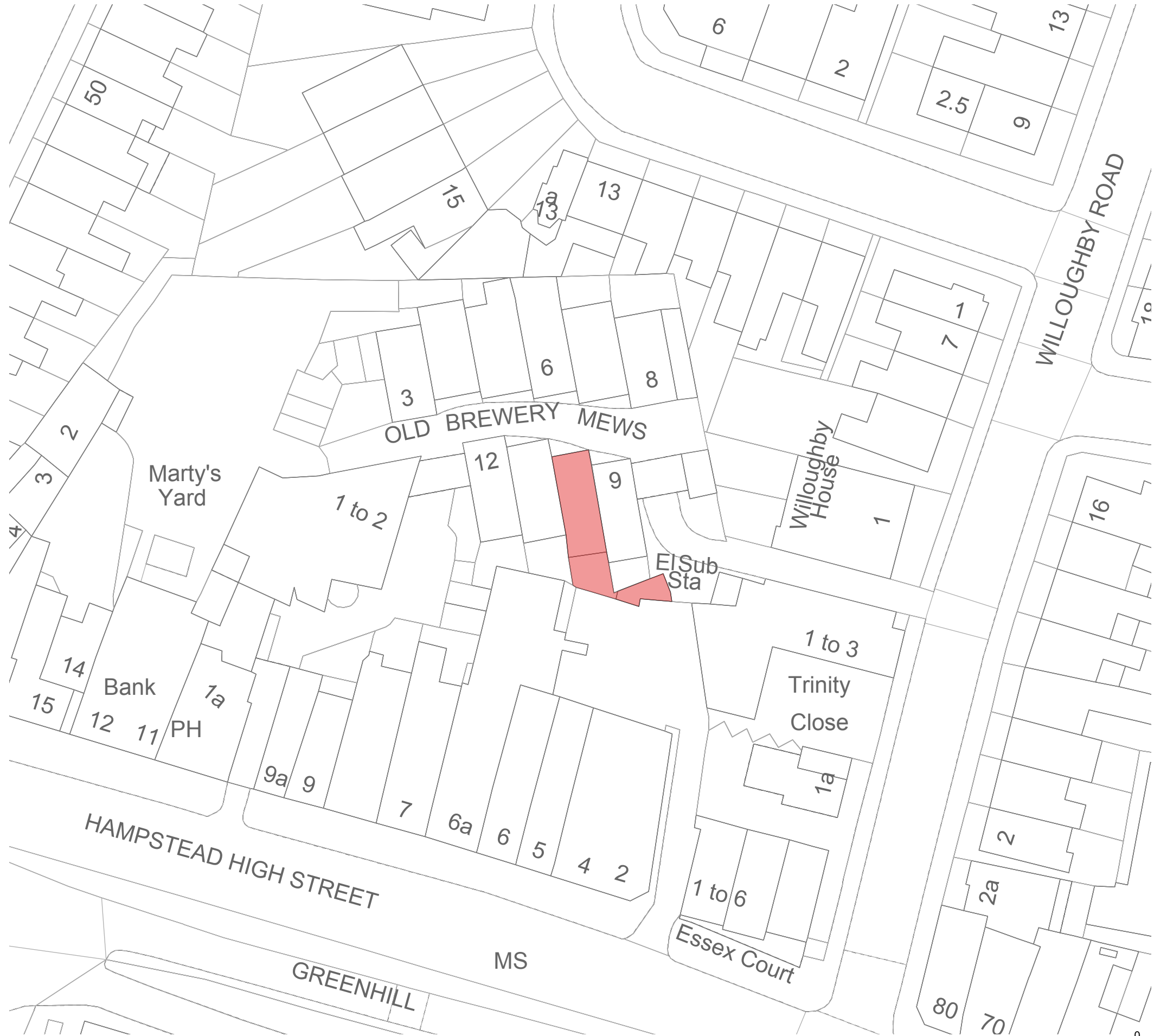
1 LOCATION 1:500