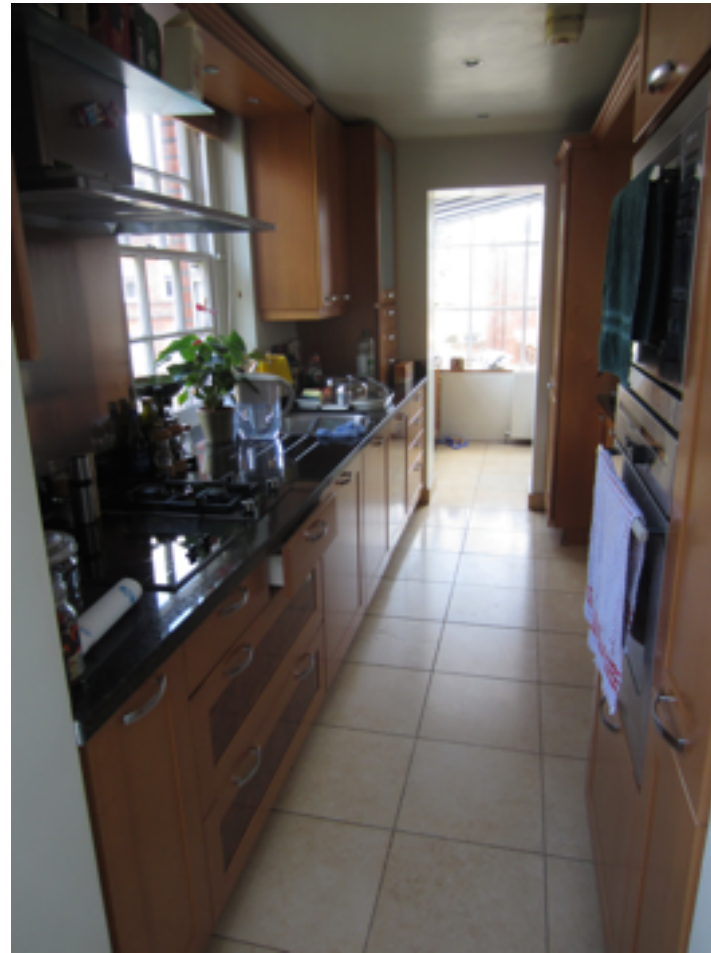
FIRST FLOOR KITCHEN