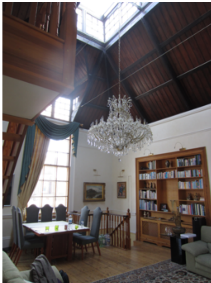
FIRST FLOOR RECEPTION