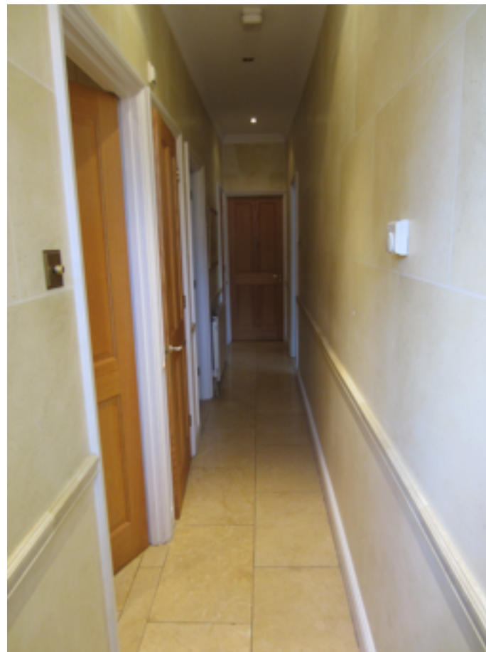
GROUND FLOOR HALLWAY