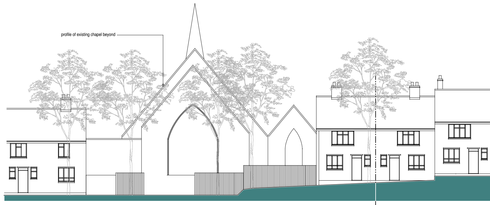
existing street elevation 1:200