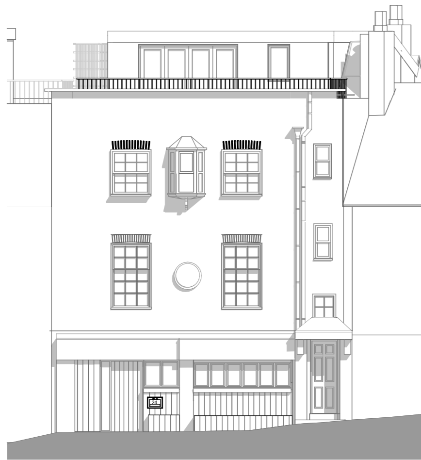
E-04 True Front Elevation 1:100