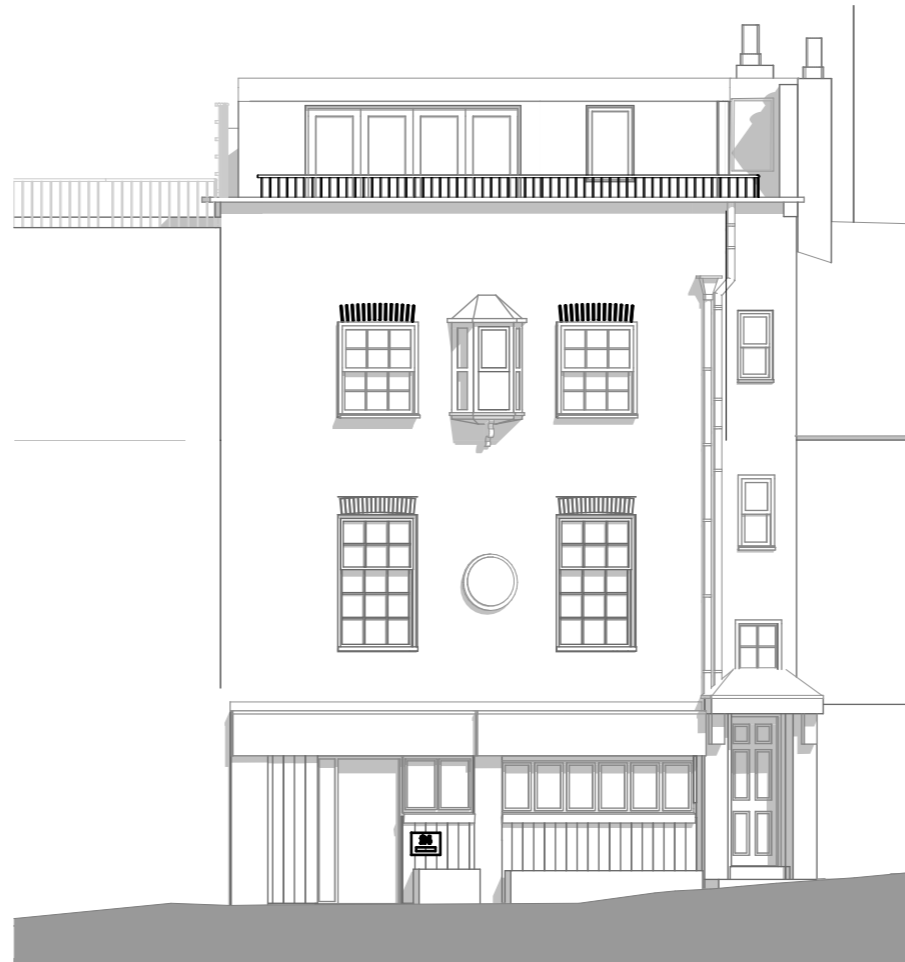
E-01 Front Elevation 1:100