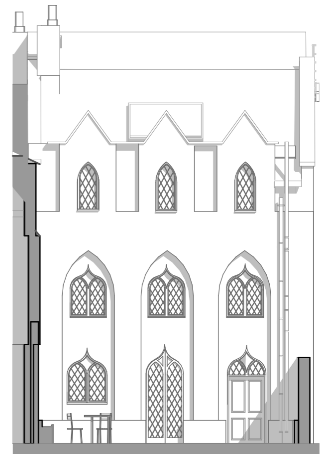
E-02 Rear Elevation 1:100

Note- No change is proposed to the existing entablature or pilasters which are not shown in detail.