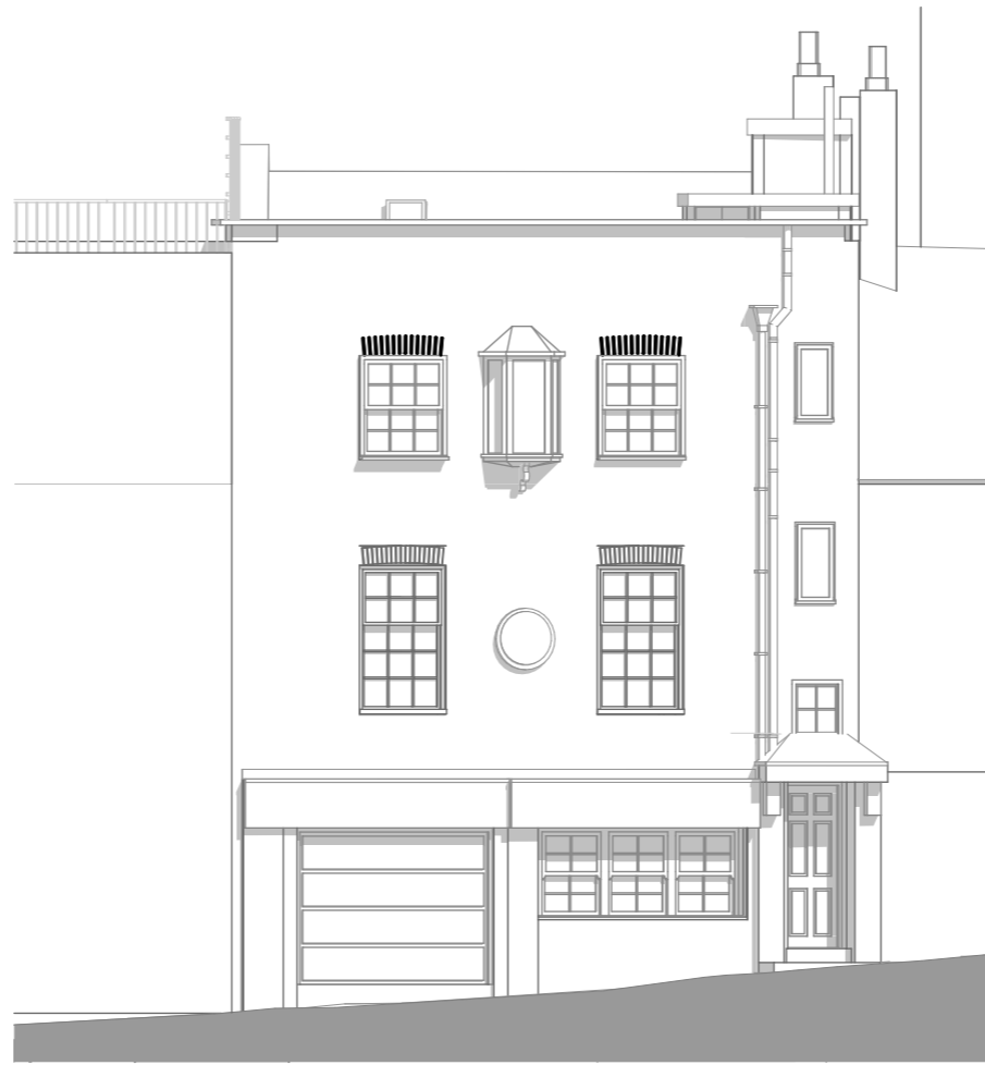
E-01 Front Elevation 1:100