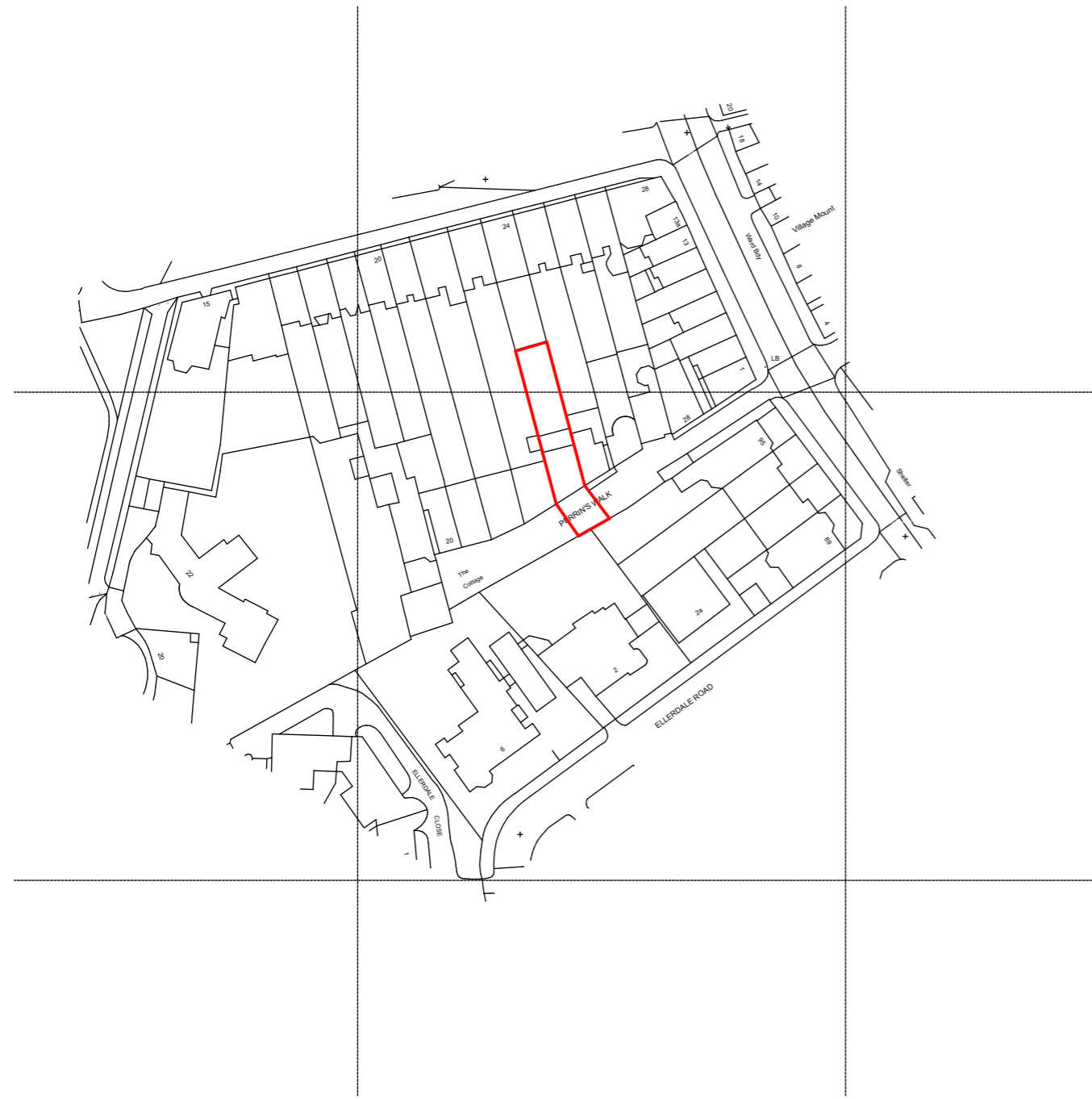
2 OS 1:1250