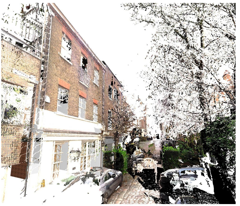
View from bottom of the street -PC