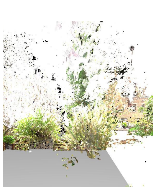
View From 24 Church Row - PC