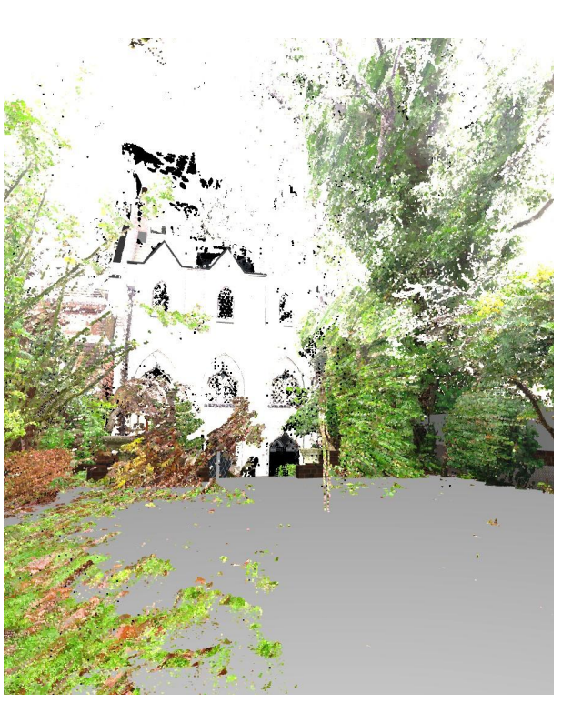
View From Garden Boundary -PC