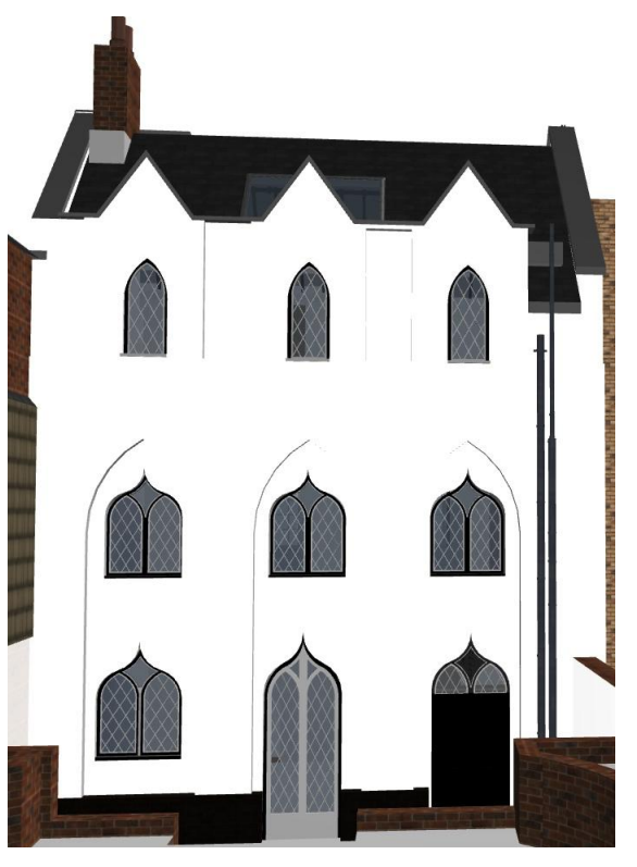
Closer view from rear Existing (No Point Cloud/foliage for clarity of model)