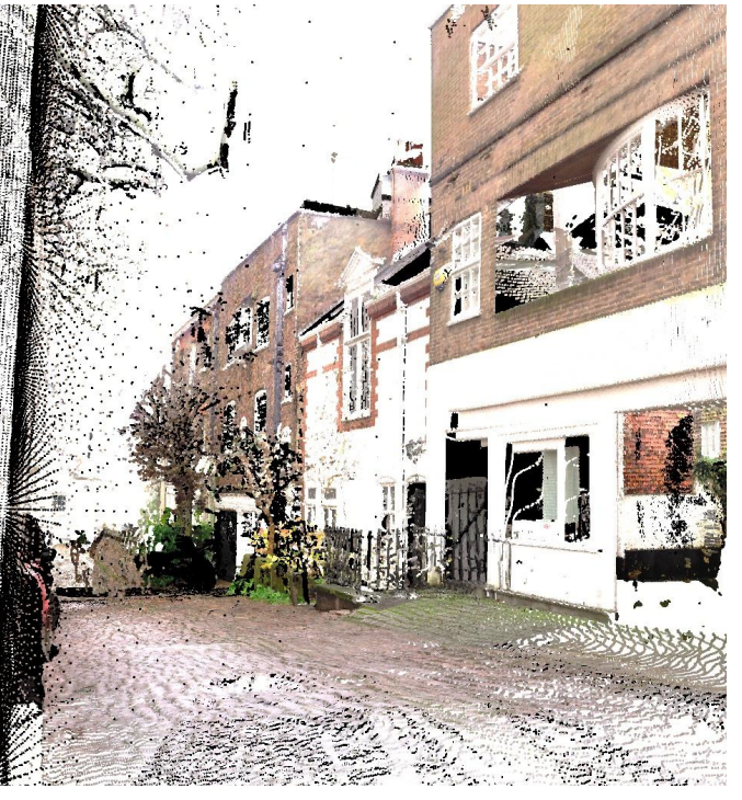
View of maximum visibility -PC