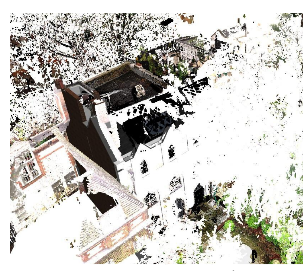
View - birds eye view existing PC