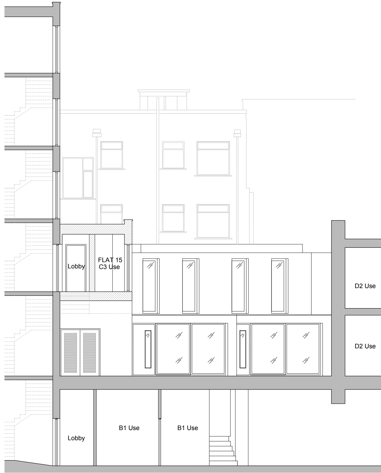
00(EL)P002 Proposed East Facing Courtyard Elevation 04