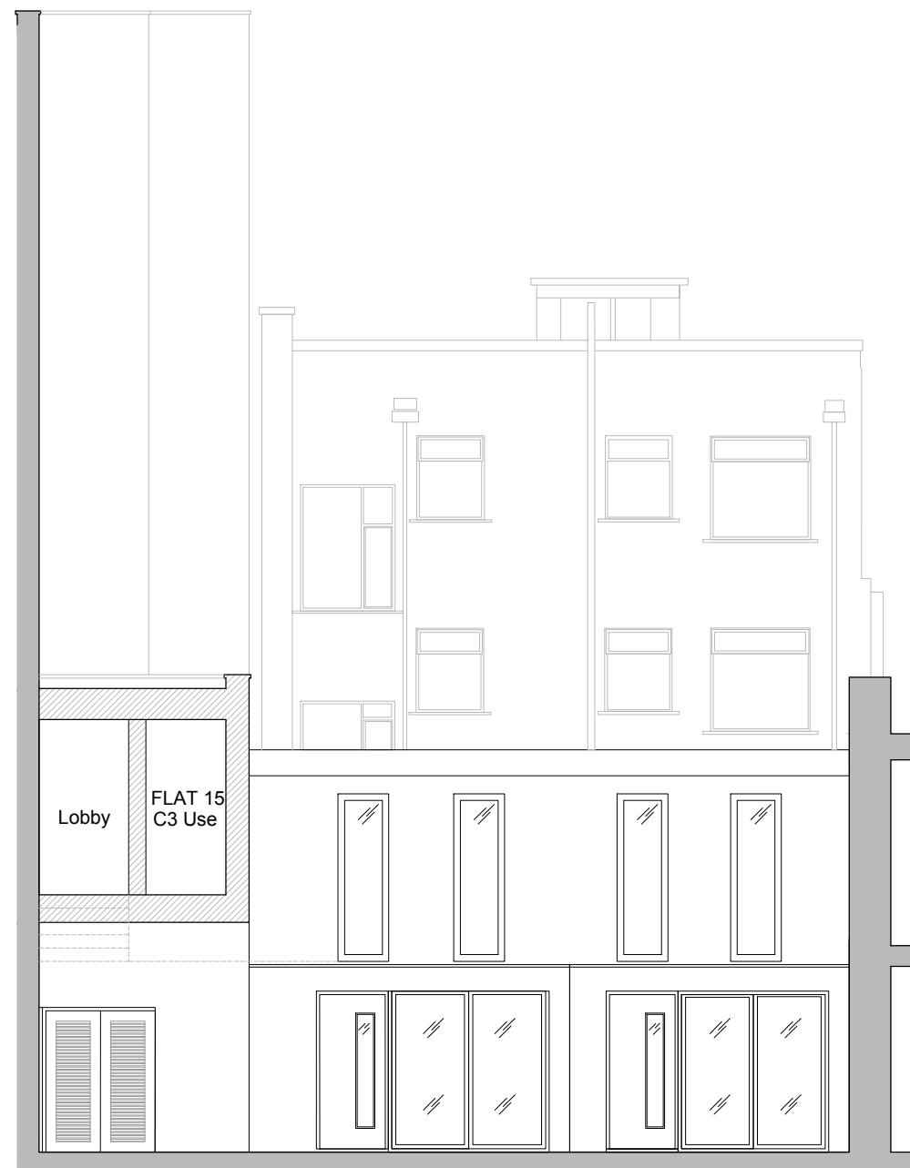
00(EL)P001 Proposed East Facing Courtyard Elevation 02