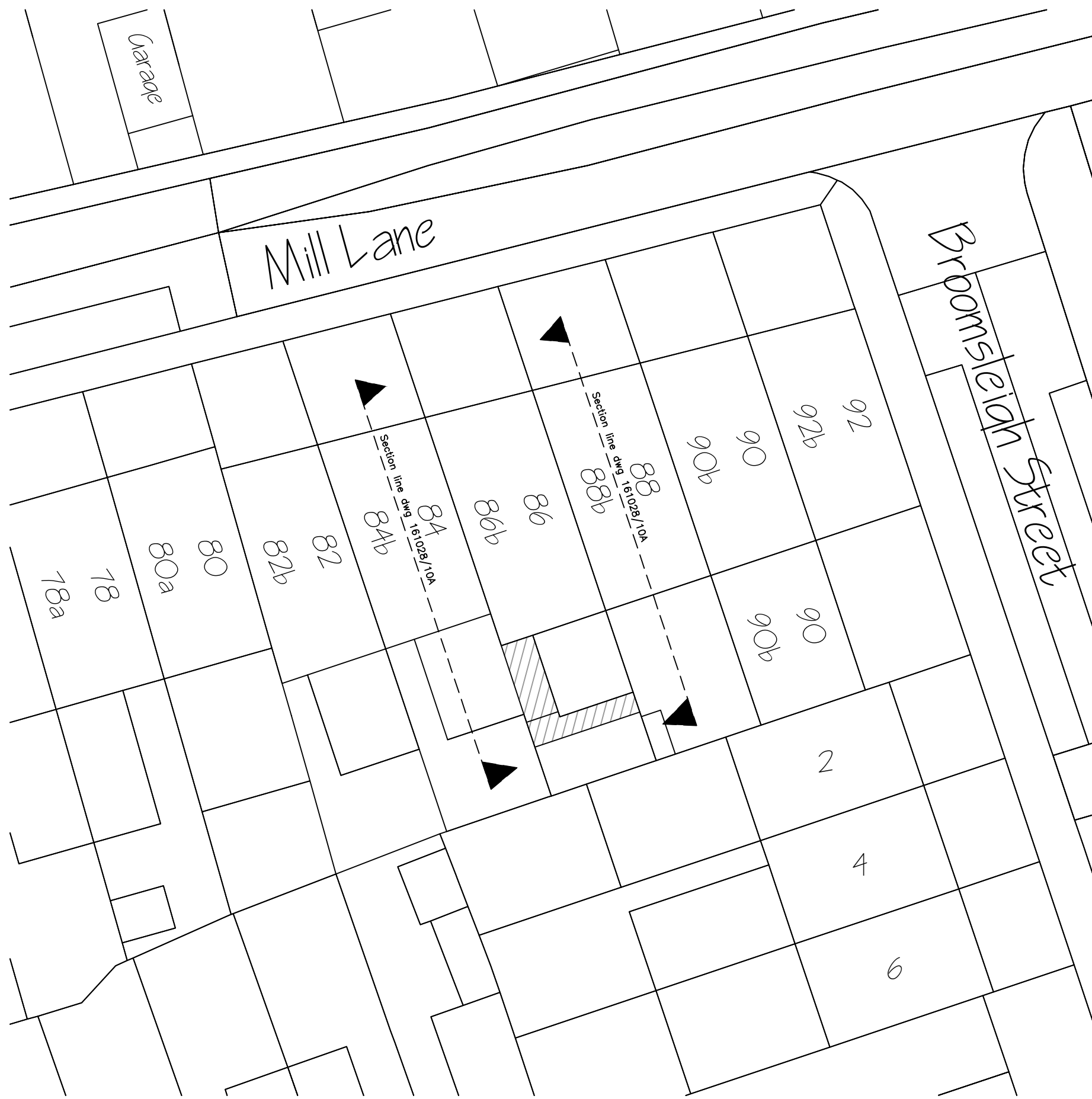
BLOCK PLAN ~ 1:200