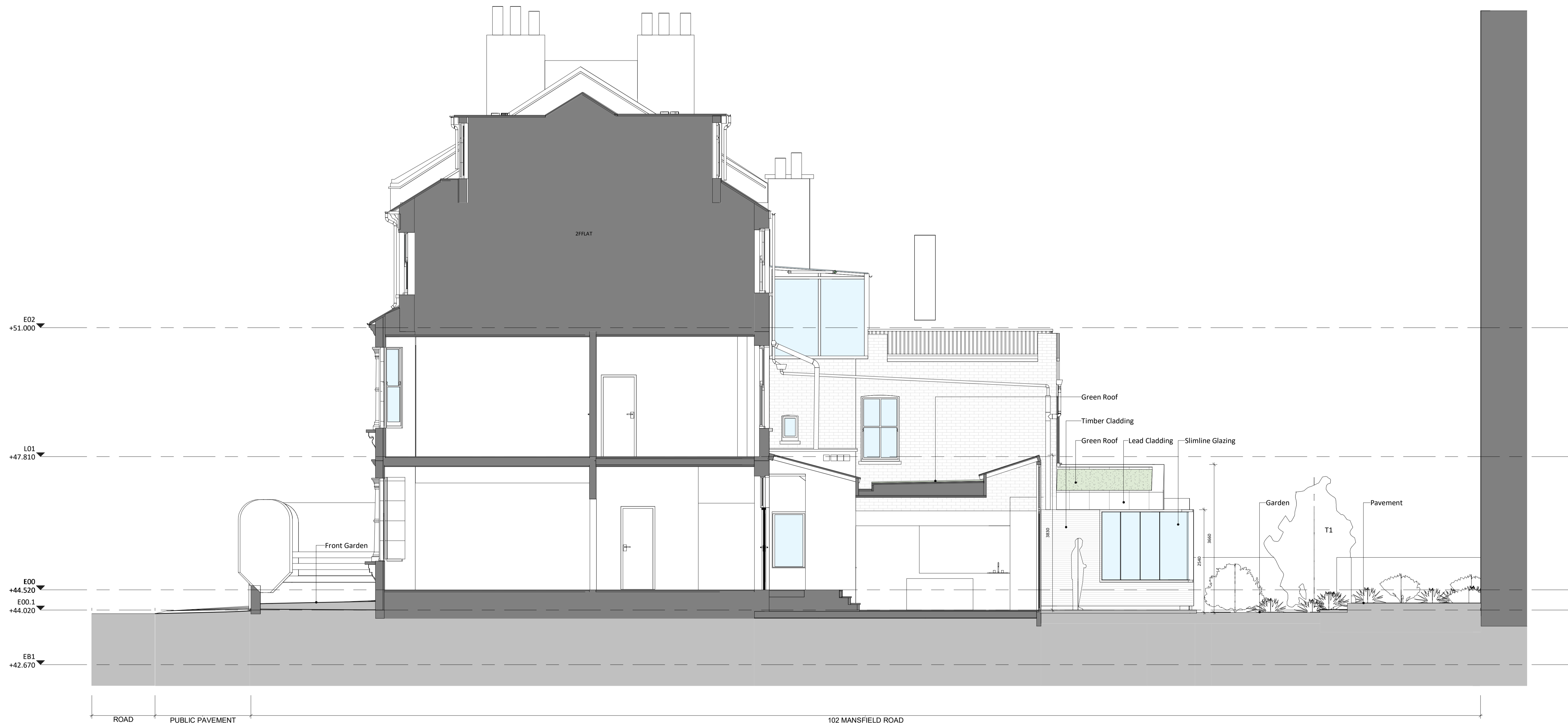
2 Section B 1:50