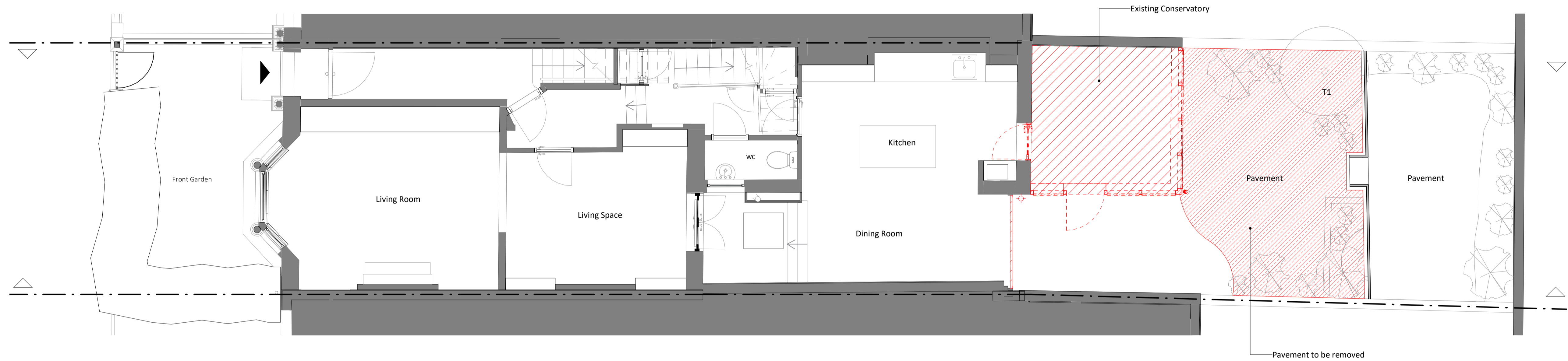
2 Ground Floor 1:50