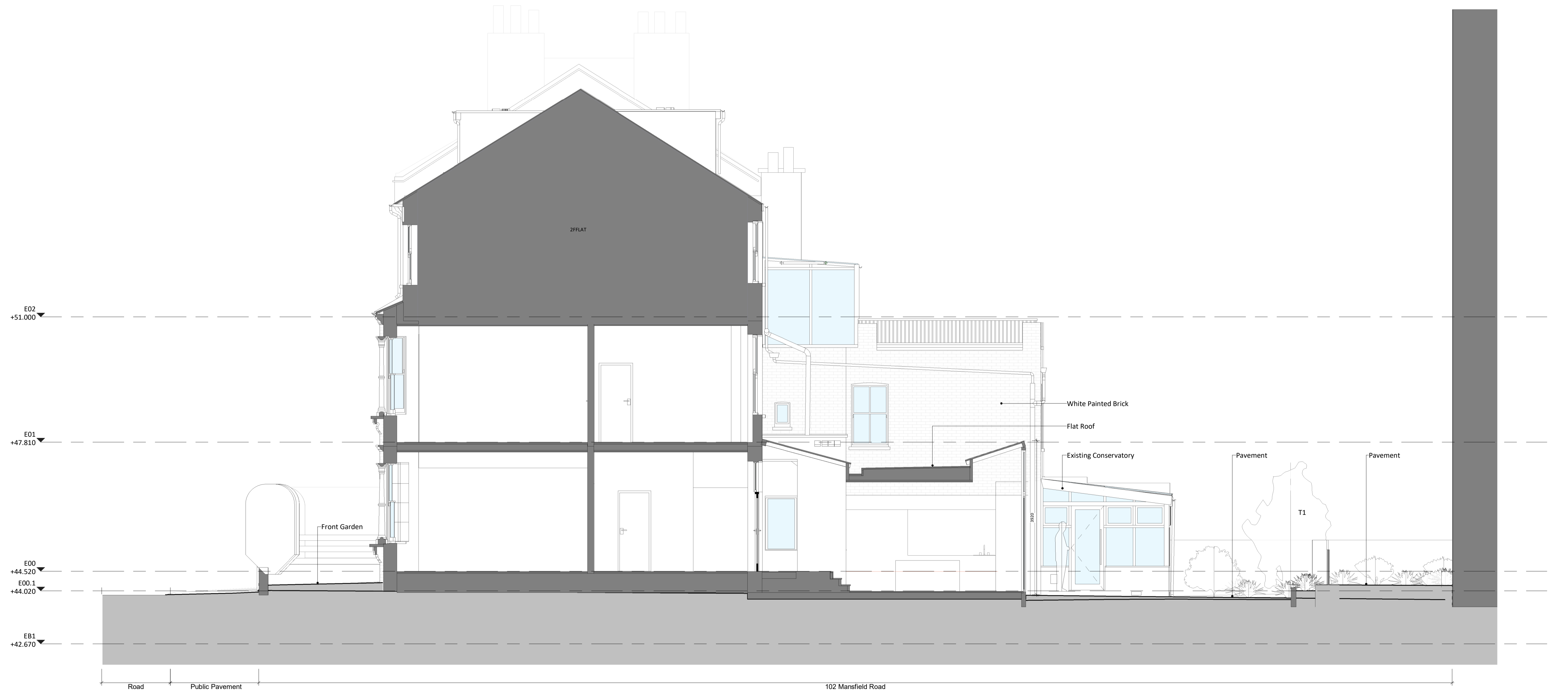
2 Section C 1 : 50