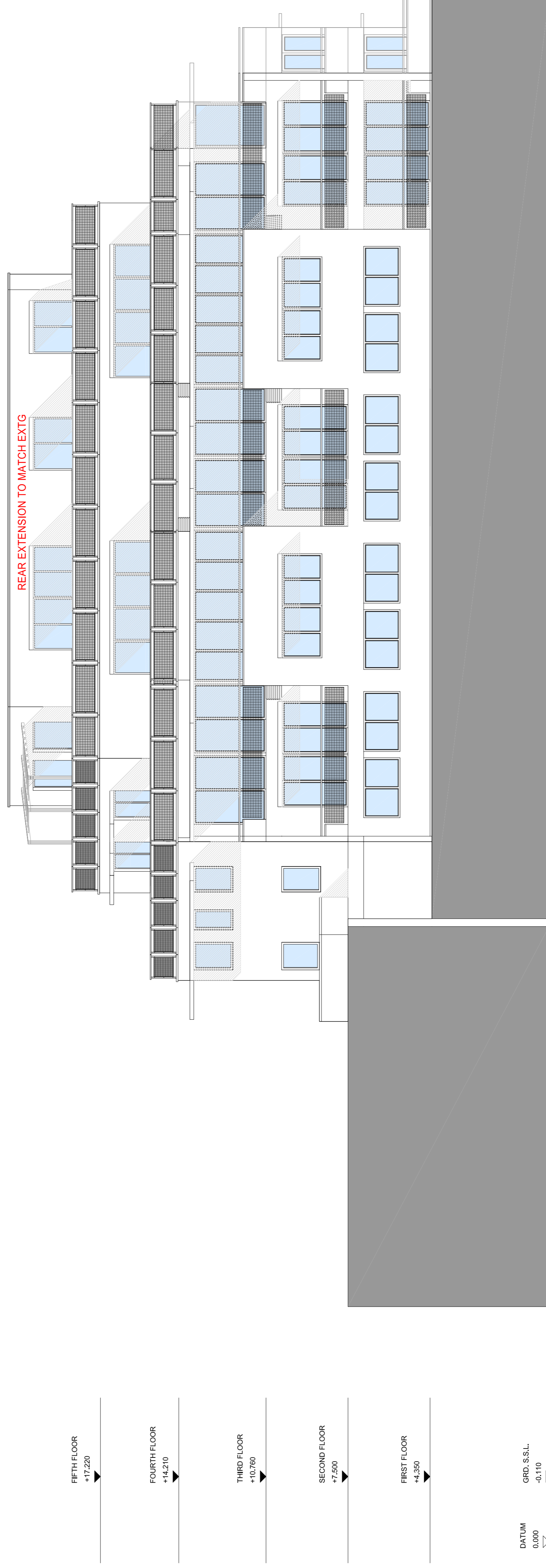
PROPOSED SOUTH ELEVATION

Rev. . . . . Date . . . . . By . . . . .