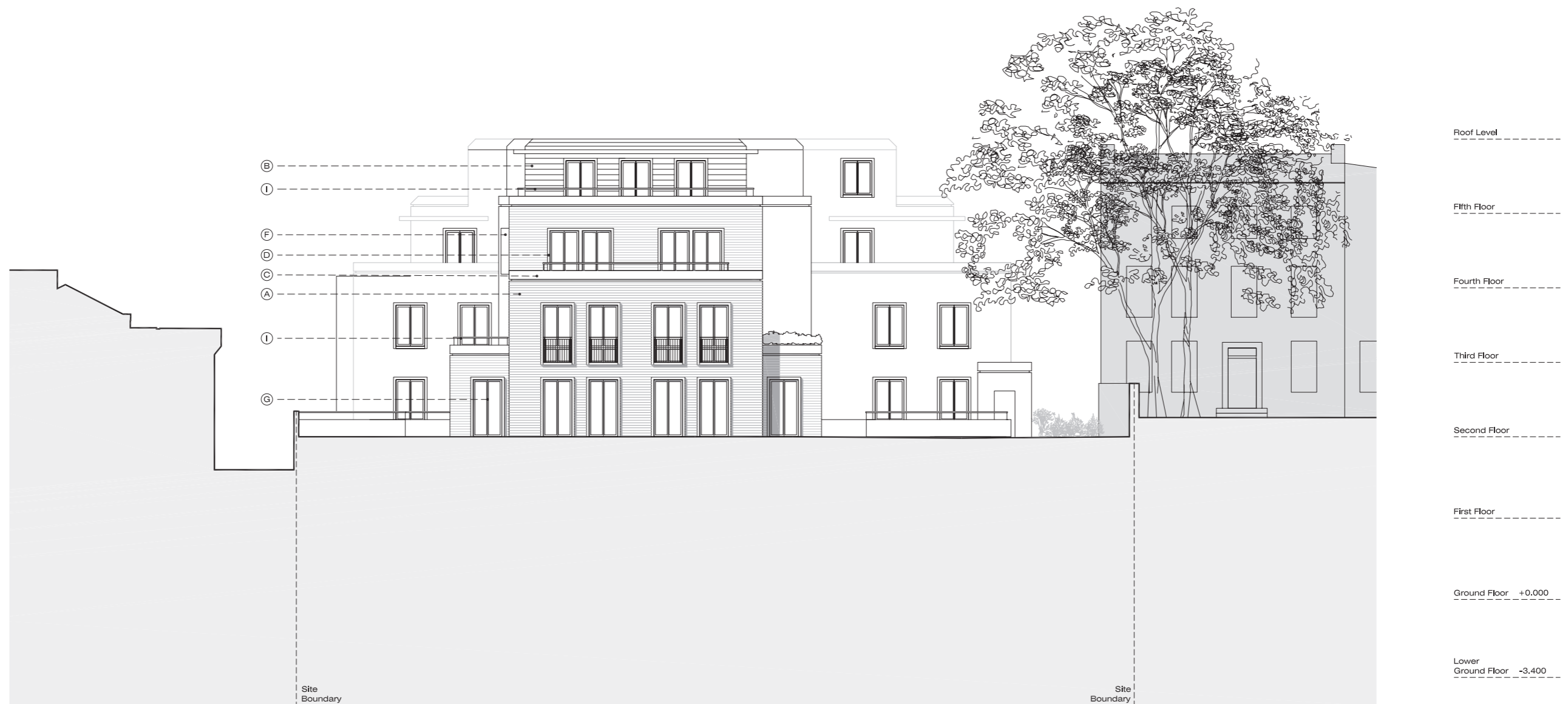
PLANNING PERMITTED NORTH ELEVATION