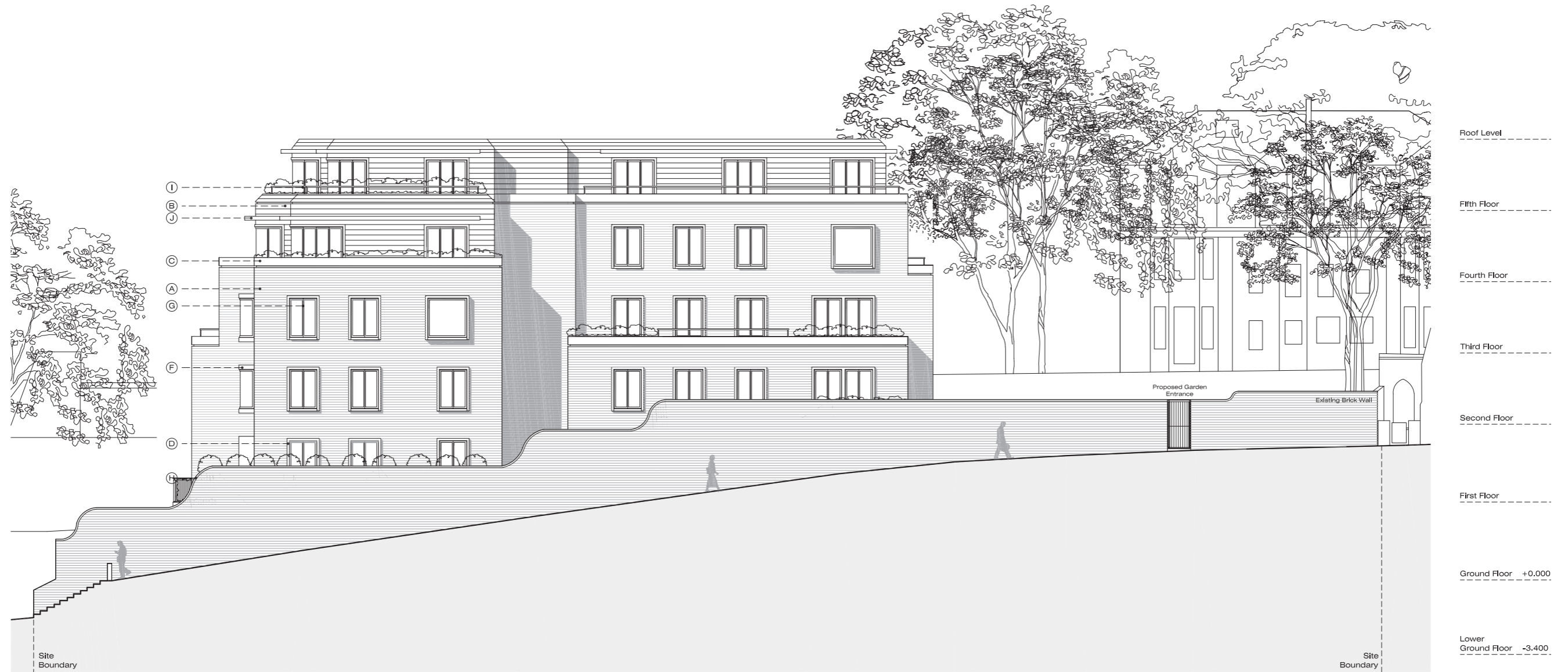
PLANNING PERMITTED EAST ELEVATION