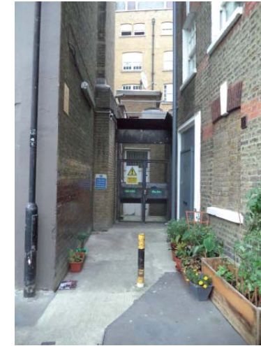
View of alley entrance - anti-social behaviour takes place here due to set-back from the street.