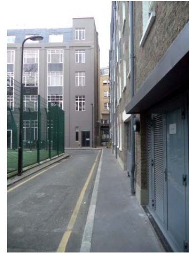
View from Whitfield Street - Wayfinding is difficult as the basement entrance is not immediately visible

The inclusion of decorative or eye catching gates between the Radisson Blu Hotel and Suffolk House would provide a solution to both issues, discouraging unauthorised access and creating a defined, safe entrance for The Warren Centre users.